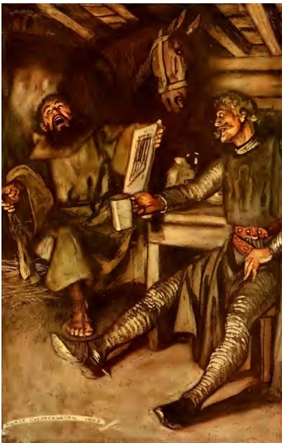
THE SONG OF 'THE BAREFOOTED FRIAR'