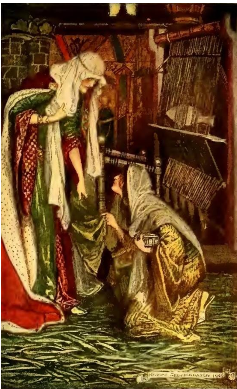
To the surprise of the Lady of Ivanhoe, her fair visitant kneeled on one knee.

“What means this, lady?” said the surprised bride; “or why do you offer to me a deference so unusual?”