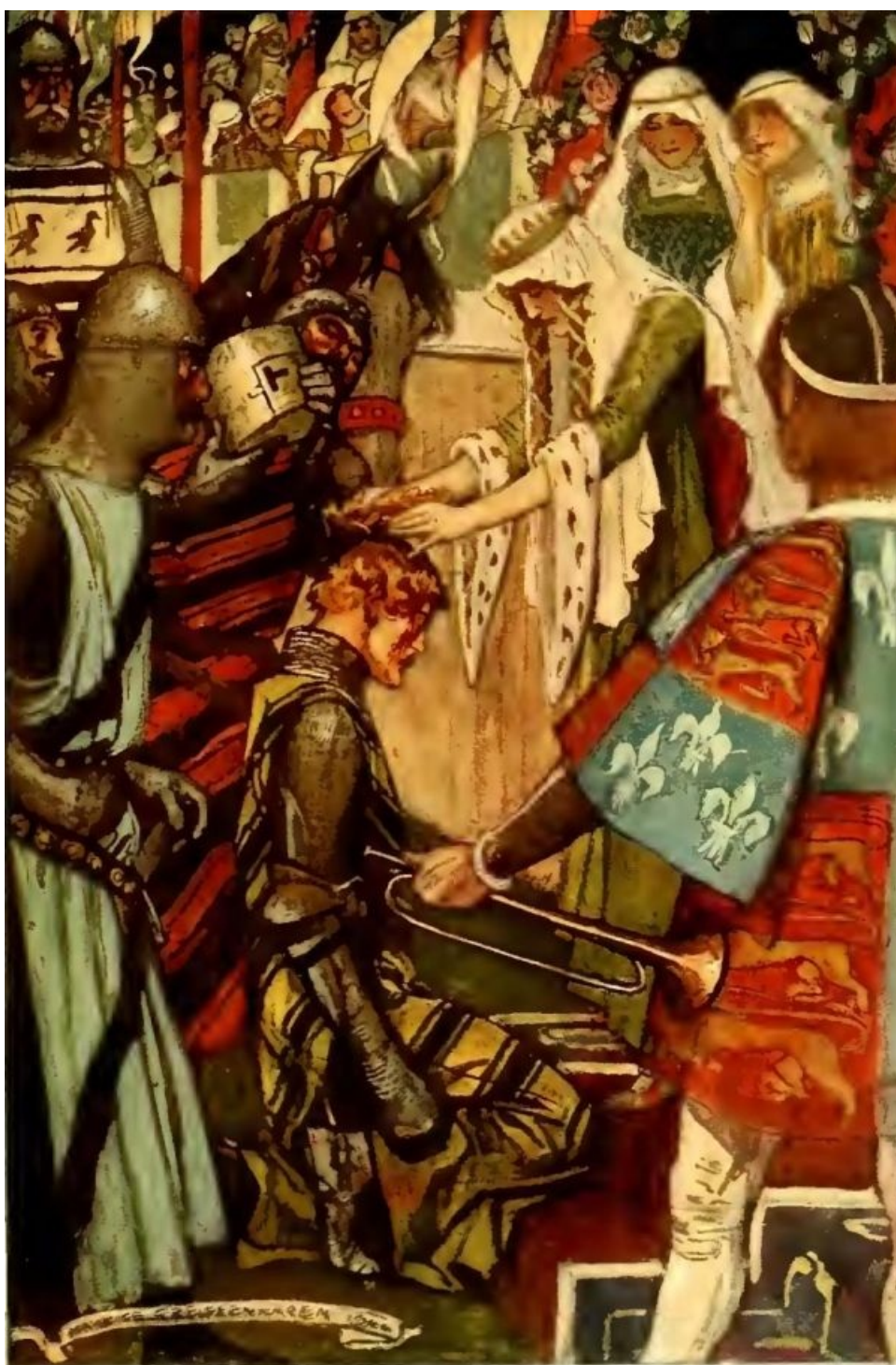
The Marshals unhelmed him by cutting the laces of his casque.