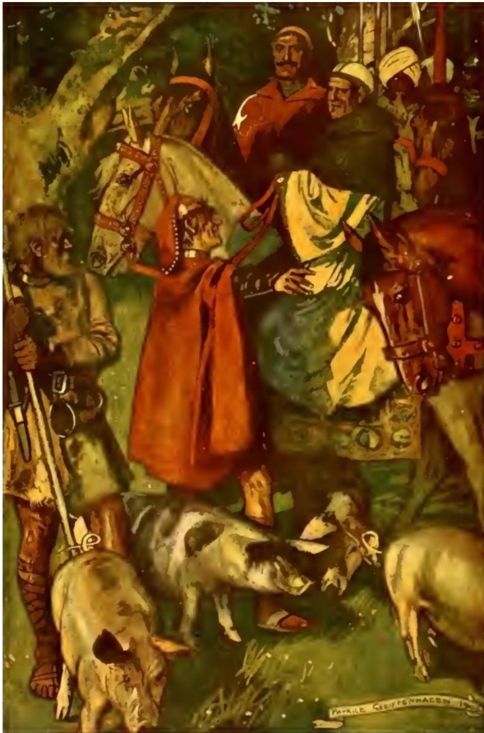
'Your reverences must hold on this path till you come to a sunken cross.'

“Well, then,” answered Wamba, “your reverences must hold on this path till you come to a sunken cross, of which scarce a cubit's length remains above ground; then take the path to the left, for there are four which meet at Sunken Cross, and I trust your reverences will obtain shelter before the storm comes on.”