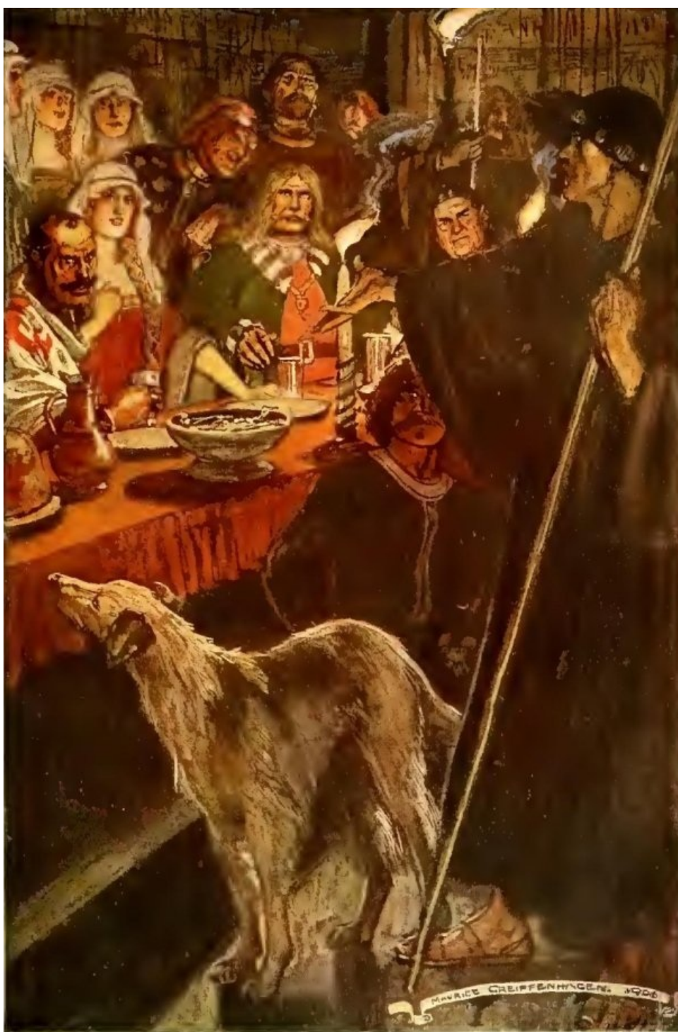
'Second to NONE,' said the Pilgrim, who stood near enough to hear.