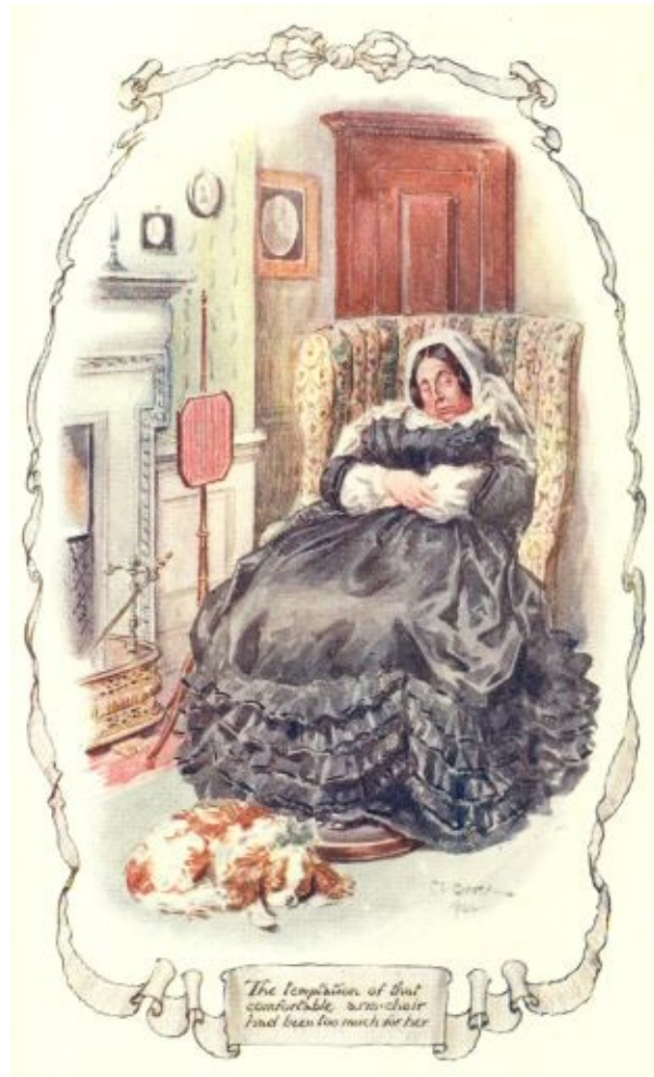
The temptation of that comfortable arm-chair had been too much for her

After tea there was some little demur and difficulty. We were six in number; four could play at Preference, and for the other two there was Cribbage. But all, except myself (I was rather afraid of the Cranford ladies at cards, for it was the most earnest and serious business they ever engaged in), were anxious to be of the "pool." Even Miss Barker, while declaring she did not know Spadille from Manille, was evidently hankering to take a hand. The dilemma was soon put an end to by a singular kind of noise. If a baron's daughter-in-law could ever be supposed to snore, I should have said Mrs Jamieson did so then; for, overcome by the heat of the room, and inclined to doze by nature, the temptation of that very comfortable arm-chair had been too much for her, and Mrs Jamieson was nodding. Once or twice she opened her eyes with an effort, and calmly but unconsciously smiled upon us; but by-and-by, even her benevolence was not equal to this exertion, and she was sound asleep.