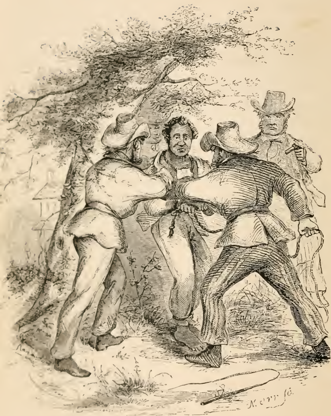
CHAPIN RESCUES SOLOMON FROM HANGING.