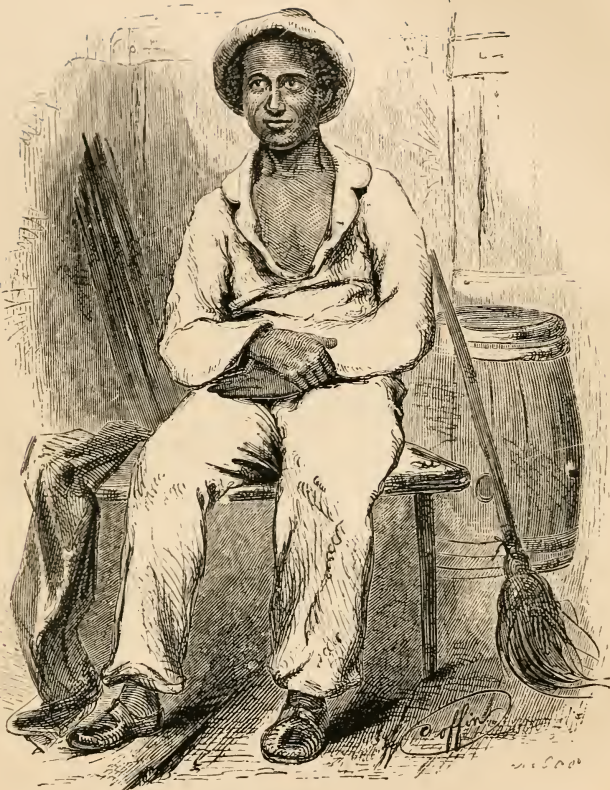
SOLOMON IN HIS PLANTATION SUIT.