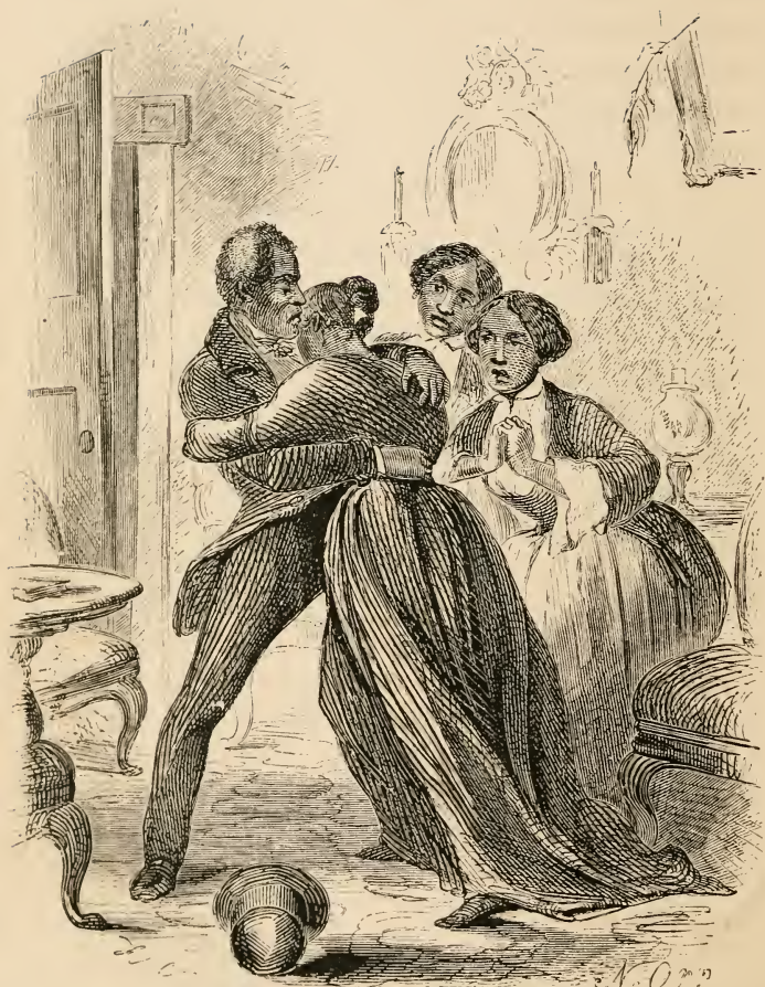
RIVAL HOME, AND FIRST MEETING WITH HIS WIFE AND CHILDREN