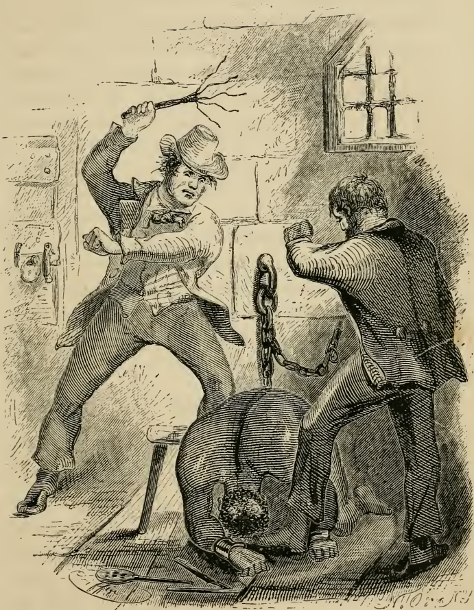
SCENE IN THE SLAVE PEN AT WASHINGTON.