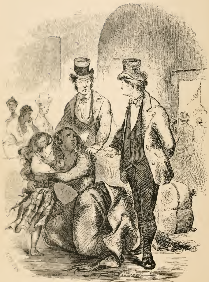
SEPERATION OF ELIZA AND HER LAST CHILD.