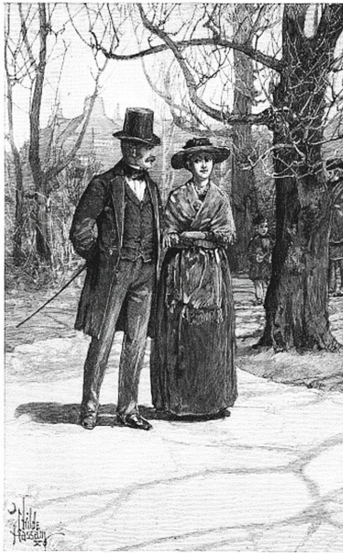
ESTHER LYON AND HAROLD TRANSOME.

Looking back and seeing that they were a good deal in advance of the rest, Esther and Harold paused.