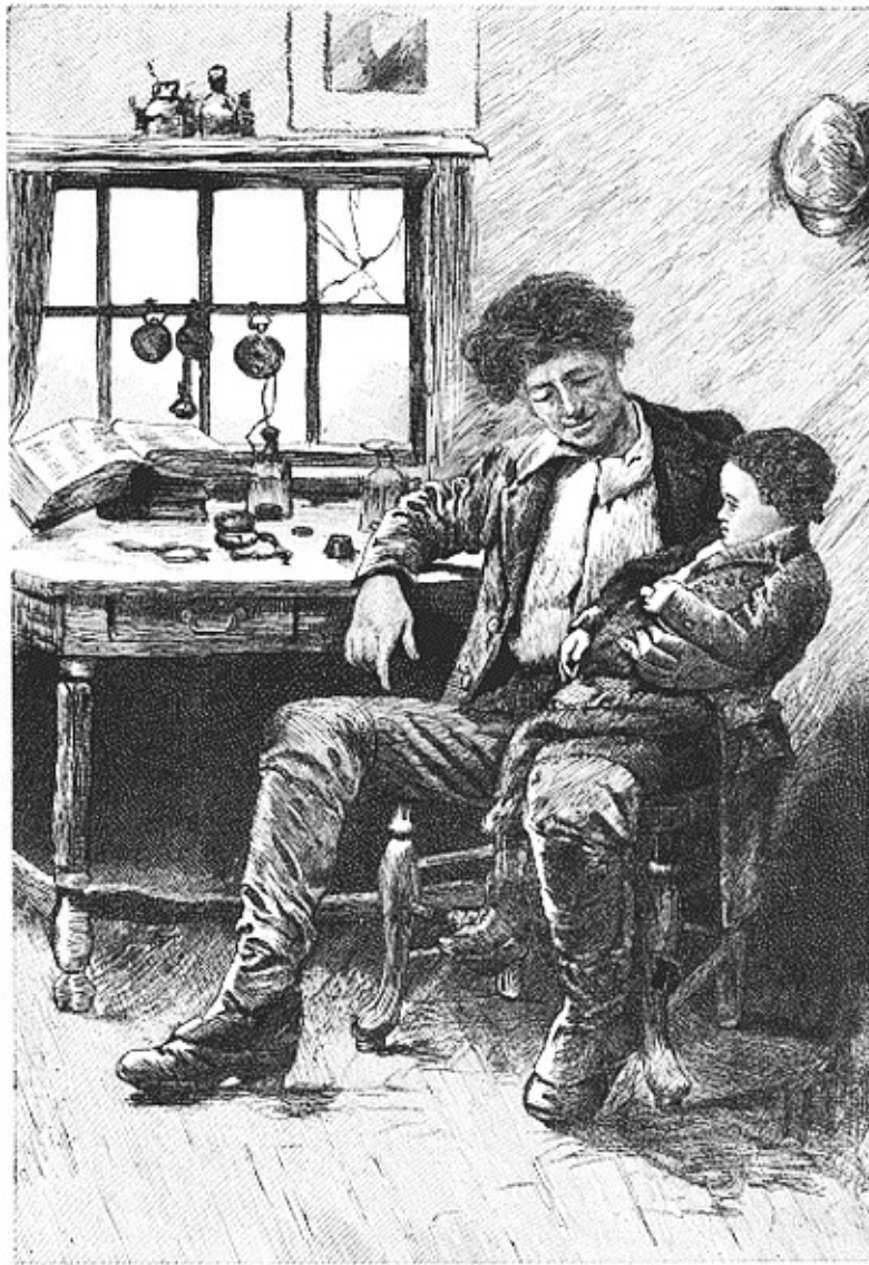
FELIX HOLT AND JOB TUDGE.

"Did you ever see," said Mrs. Holt, standing to look on, "how wonderful Felix is at that small work with his large fingers? And that's because he learned doctoring. It isn't for want of cleverness he looks like a poor man, Miss Lyon. I've left off speaking, else I should say it's a sin and a shame."