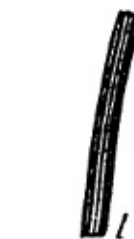
Fig. 5. Vittaria