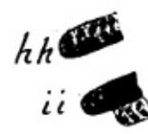
Fig. 11. Danaea