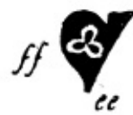
Fig. 10. Gleichenia