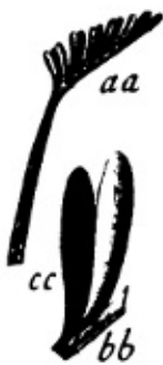
Fig. 9. Schizaea