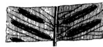
Fig. 2. Scolopendrium