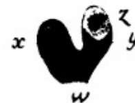
Fig. 8. Hymenophyllum