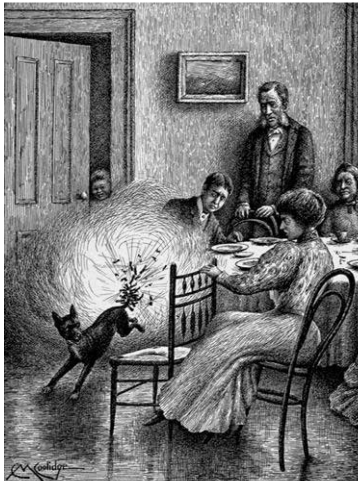
THE FUNNY FOURTH RACKET ON ENGLISH SOIL.