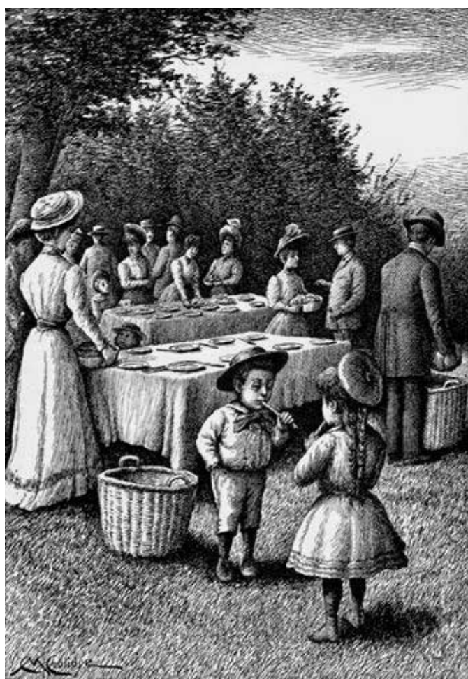
A FEAST IS BETTER THAN FIRECRACKERS.

“And so they have got their wedding reception after all, Angeline,” laughed Mr. Cornwallis, “and without any fussery or finery of the tiresome cut and dried pattern.”