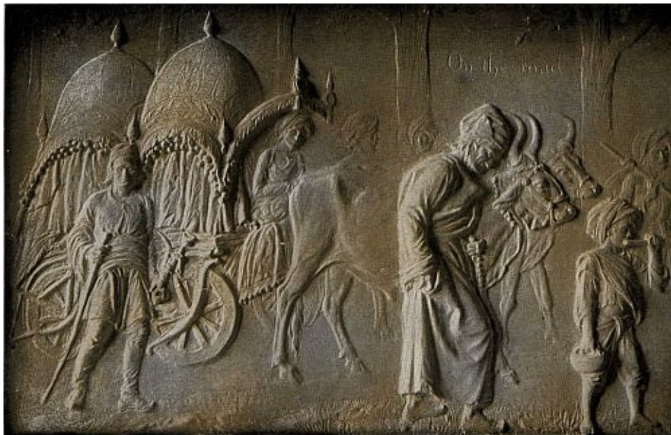
The Lama and Kim walked a little to one side; Kim chewing his stick of sugar-cane, and making way for no one under the status of a priest.

By this time the sun was driving broad golden spokes through the lower branches of the mango trees; the parakeets and doves were coming home in their hundreds; the chattering, gray-backed Seven Sisters, talking over the day's adventures, walked back and forth in twos and threes almost under the feet of the travellers; and shufflings and scufflings in the branches showed that the bats were ready to go out on the night-picket. Swiftly the light gathered itself together, painted for an instant the faces and the cart-wheels and the bullocks' horns as red as blood. Then the night fell, changing the touch of the air, drawing a low, even haze, like a gossamer veil of blue, across the face of the country, and bringing out, keen and distinct, the smell of wood-smoke and cattle and the good scent of wheaten cakes cooked on ashes. The evening patrol hurried out of the police-station with important coughings and reiterated orders; and a live charcoal ball in the cup of a wayside carter's hookah glowed red while Kim's eye mechanically watched the last flicker of the sun on the brass tweezers.