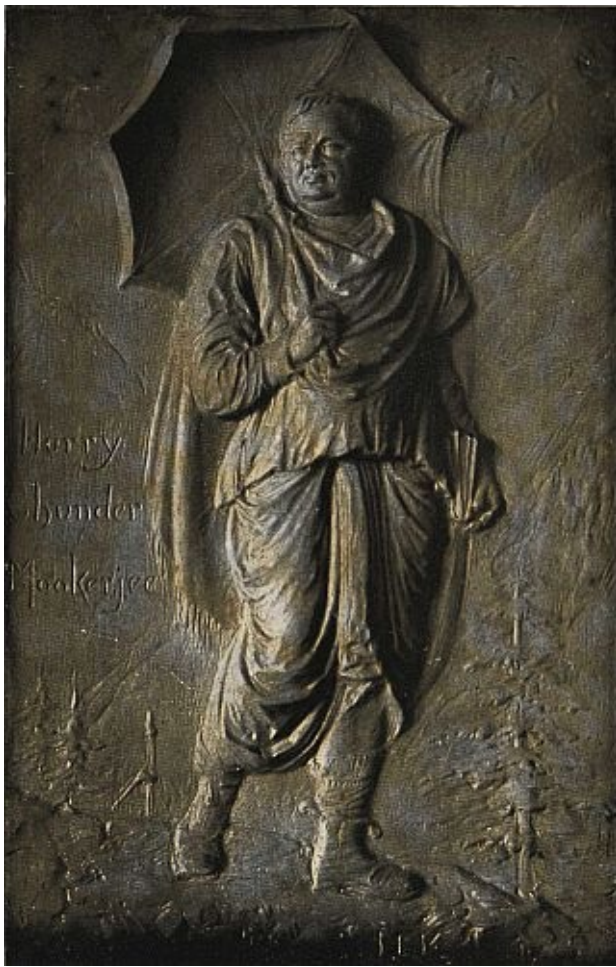
Full-fleshed, heavy-haunched, bull-necked, and deep-voiced.

Kim looked him over out of the corners of his eyes. He was a Sahib in that he wore Sahib's clothes; the accent of his Urdu, the intonation of his English, showed that he was anything but a Sahib. He seemed to understand what moved in Kim's mind ere the boy opened his mouth, and he took no pains to explain himself as did Father Victor or the Lucknow masters. Sweetest of all—he treated Kim as an equal on the Asiatic side.