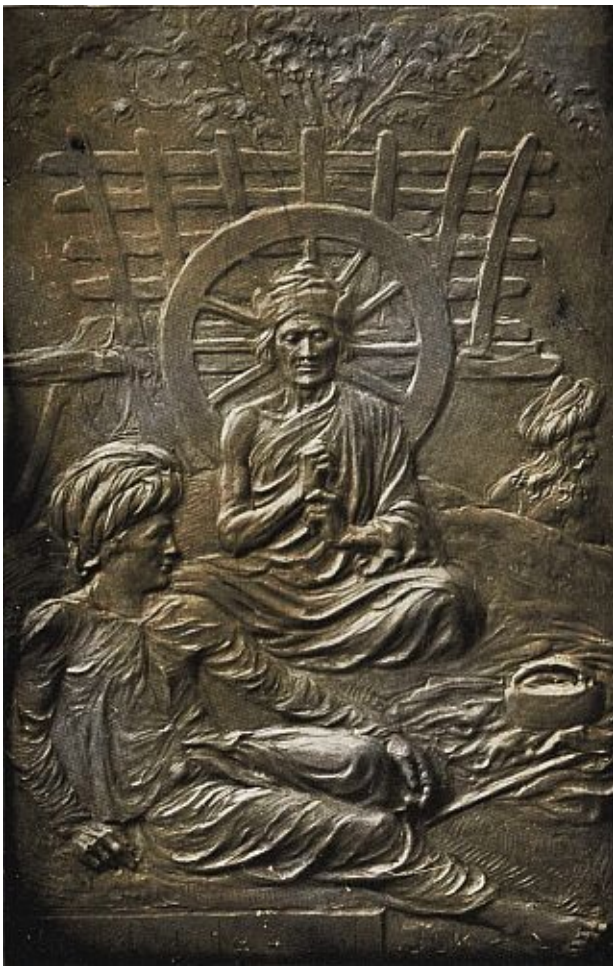
He crossed his hands on his lap and smiled, as a man who has won Salvation for himself and his beloved.