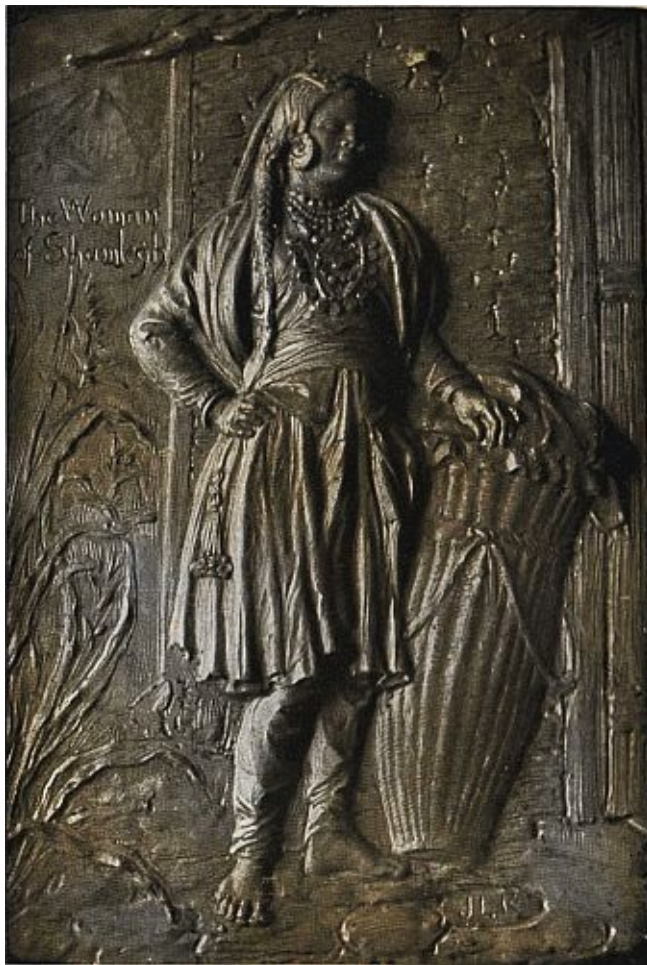
'I am the woman of Shamlegh.'

called 'adventitious aids' he might still tread his distances. To keep count of thousands of paces, Hurree Chunder's experience had shown him nothing more valuable than a rosary of eighty-one or a hundred and eight beads, for 'it was divisible and sub-divisible into many multiples and sub-multiples.' Through the volleying drifts of English, Kim caught the general trend of the talk, and it interested him very much. Here was a new craft that a man could tuck away in his head; and by the look of the large wide world unfolding itself before him, it seemed that the more a man knew the better for him.