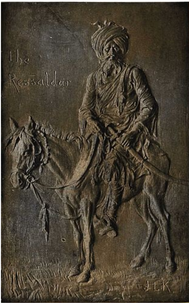
He sat long-legged on the little beast, with the big sword at his side—hand dropped on the pommel—staring fiercely ever the flat Lands. . .