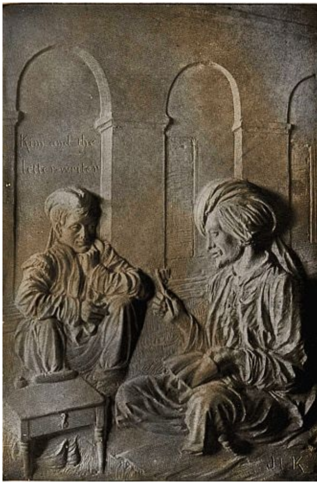
'First I will take my pay,' the letter-writer said.

'It does not profit to tell lies to Mahbub Ali. It is better to help his friends by lending them a stamp. When the money comes I will repay.'