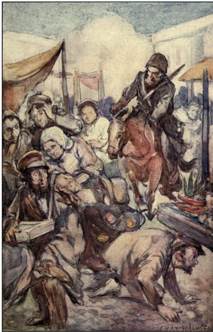
The Jews scattered before him like dogs. ToList