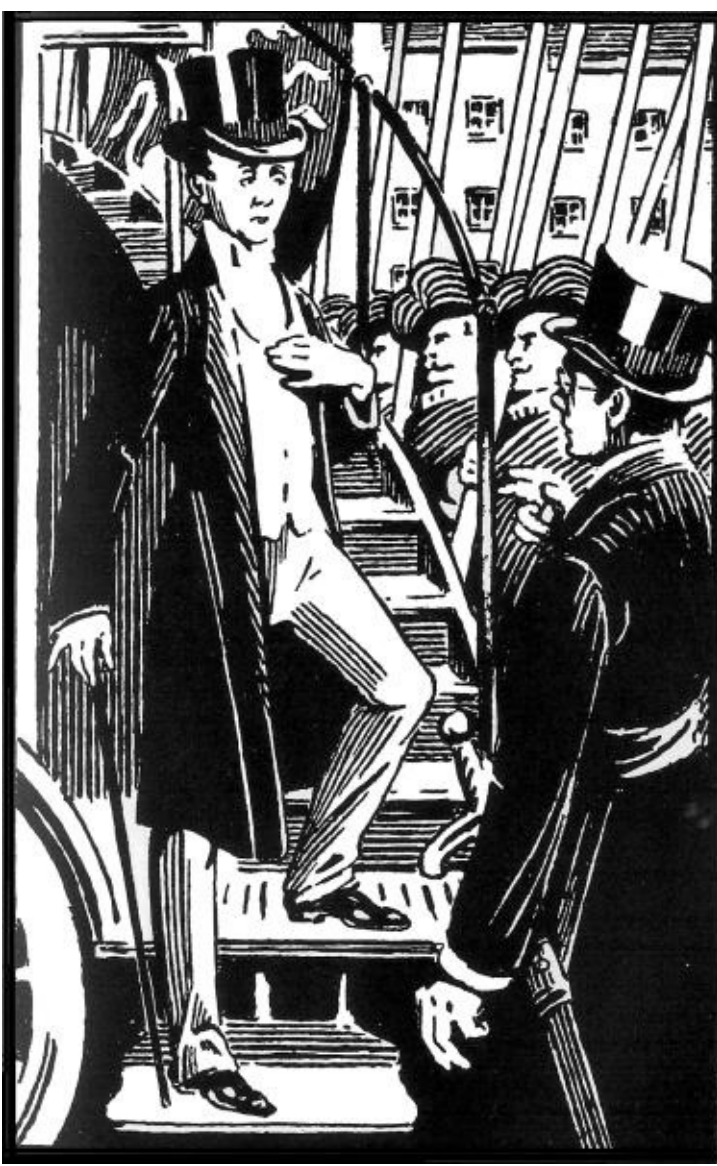
KING AUBERON DESCENDED FROM THE OMNIBUS WITH DIGNITY.

King Auberon descended from the omnibus with dignity. The guard or picket of red halberdiers who had stopped the vehicle did not number more than twenty, and they were under the command of a short, dark, clever-looking young man, conspicuous among the rest as being clad in an ordinary frock-coat, but girt round the waist with a red sash and a long seventeenth-century sword. A shiny silk hat and spectacles completed the outfit in a pleasing manner.