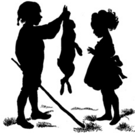
POOR DEAD PUSSY!

There he stood, his eyes and mouth all one smile, and held out at arm's length by the ears a dead rabbit. My look and exclamation of horror made him grave at once.