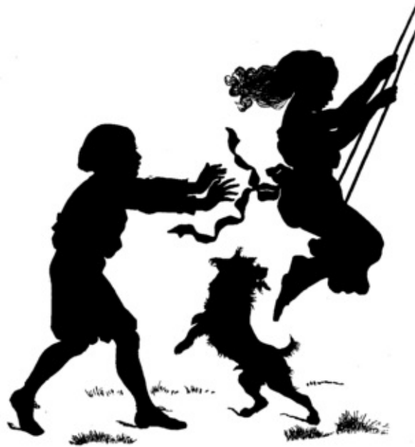
UP TO THE MOON!

And, first of all, we thought of the swing as the best thing to be done, and for half an hour it was most delightful! Don't you know the pleasant feeling it is, just up at the very highest point, when you are not quite sure whether you are frightened or not? Don't you know? And you laugh a little anxiously, and are very glad to find yourself safely down again. Oh, it was very good fun for a little while ! Only Harry came to swing us, and he was so fond of seeing your feet up into the branches, that you never could be quite sure that he would not send you head-over-heels. Lottie was very brave, but I could not quite stand it, so I stood by and watched; and when they asked me to have another try, I said, "No, thank you." I think Alick saw that I was a little red and uncomfortable, for he asked me to come and play on the lawn. We ran away, taking a last look at the two elder ones. It was not such boisterous play that we had, we two together, yet I think we enjoyed it very much, half-talking, half-playing. We were very good friends, and the morning went very quickly. When the dinner-bell rang, we agreed that we would start off together as soon as we could for the apple-orchard at the top of the hill, where we were not likely to be disturbed.