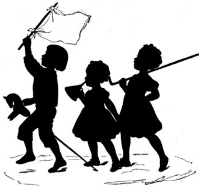
GOING TO THE WARS.

"Sissy, let's come and have a nice quiet walk together, and leave the boys to play by themselves."