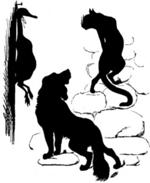
THE CAT THAT WANTED THE GOOSE.

things pretty" in the drawing-room, and would she scold me if I was sent away for crying and making a noise? But Uncle Hugh came to my rescue, threw away his paper, and cuddled me up in his great strong arms almost like papa. And he showed me his watch, and made it strike, and then began to show me all kinds of wonders about the room: little tiny black men under a glass case, small china monkeys, cats and frogs, and funny shells and fishes, and snakes' skins, and lots of other things. And after that we came back to the easy-chair, and he sang me sailors' songs, and told me all about "The House that Jack built!"