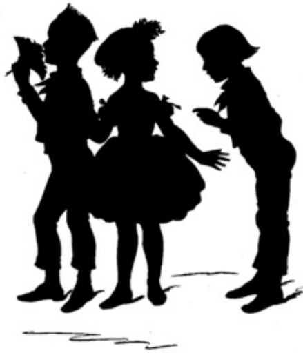
GOING TO A PARTY.

Oh, those bursts of laughter peeling out again and again! Oh, the writhings and twistings of Uncle Hugh in his excessive mirth! Would they ever stop laughing? Even now my cheeks almost tingle with those painful blushes, and my heart beats with that frightened shame!