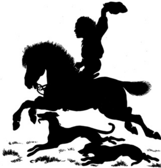
THROUGH THICK AND THIN.

That afternoon we were longer than usual on the sea, only returning just in time for a late tea and bed. Uncle Hugh started about seven o'clock, and Harry as usual mounted his pony in great haste to go with him part of the way. I remember that uncle was in a hurry, and did not wait for him, for as I stood undressing near the window I saw Harry waving his hat and calling after him, with the two dogs at his side.