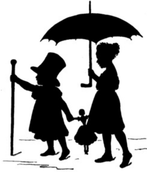
PAPA AND MAMMA.

by telling each other that papa had gone to see some little sick child like baby Willie, and to make him quite well; and then we would make up our minds to a good quiet game by ourselves.