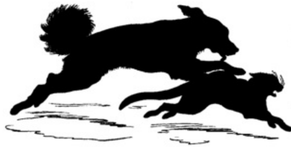
THE DOG THAT CHASED THE CAT.

"Now for the goose that Jack killed," he said; and then and there began the funniest story you ever heard. Only I can't tell it in the funny words and with the merry, twinkling glances he gave me.