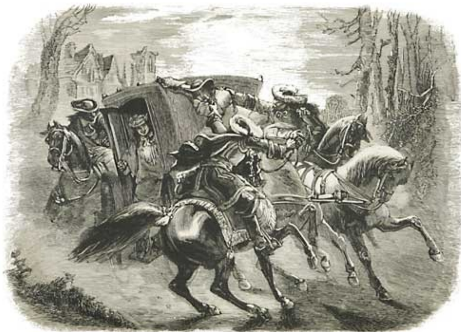
RAOUL PRESENTING HIS PISTOL THREW HIMSELF ON THE LEADER, COMMANDING THE COACHMAN TO STOP.—Page 288 .

"I think it will be a very long time, Raoul, ere I return to Paris. The last sojourn we have made there has not been of a nature to encourage me to repeat it."