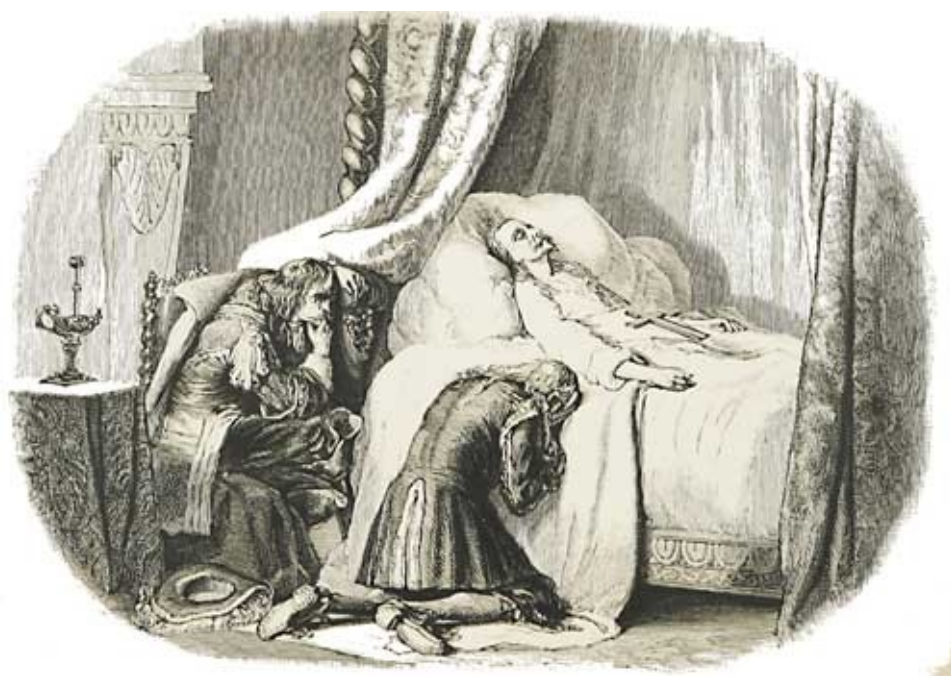
THE DEATHBED OF ATHOS—"HERE I AM!"—Page 532

"Instead of embroiling me with your brother Charles, you must make him my more intimate friend than ever."