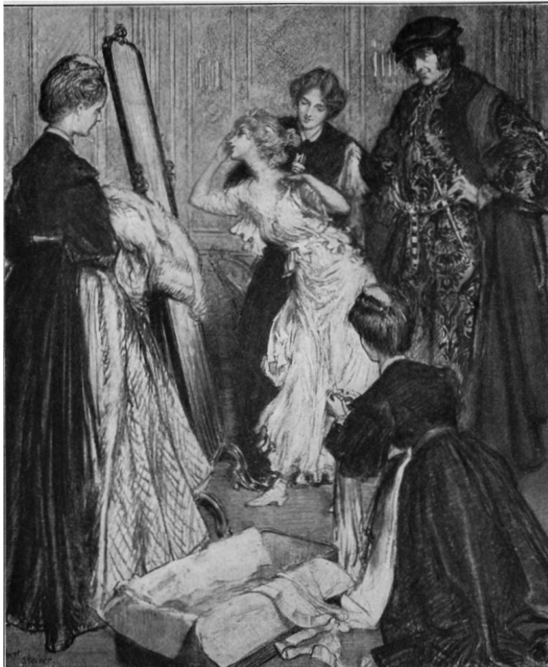
THE FINISHING TOUCHES

But neither she nor her model would have been finally content with an adornment so delicately fanciful and minute. Both Kitty and the goddess of the Fronde knew that they must hold their own in a crowd. For this there must be diamonds. The sleeves, therefore, on the white arms fell back from diamond clasps; the ivory spear in her right hand was topped by a small genius with glittering wings; and in the masses of her fair hair, bound with pearl fillets, shone the large diamond crescent that Lady Tranmore had foreseen, with one small attendant star at either side.