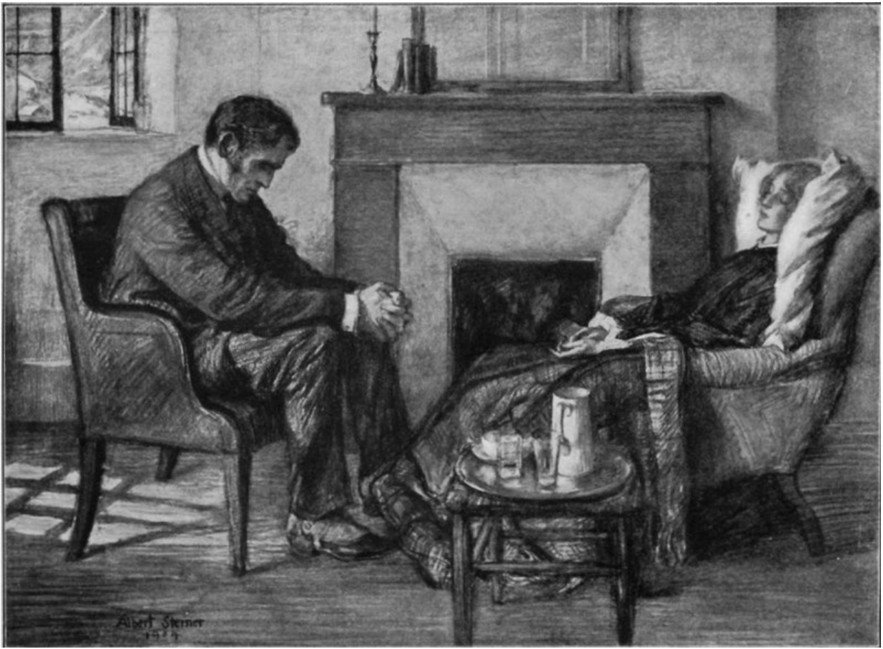
"HE DREW SOME CHAIRS TOGETHER BEFORE THE FIRE"

"Oh no!—she hated me because I had robbed her of Geoffrey. I had killed her life, I suppose—she killed mine. It was what I deserved, of course; only just at that moment—If there is a God, William, how could He have let it happen so?"