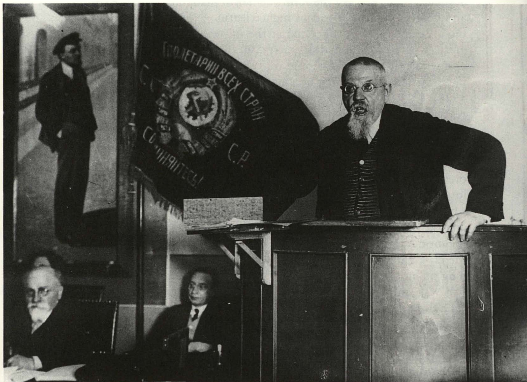
Mikhail Nikolaevich Pokrovskii speaks from the podium at the First All-Union Conference of Marxist-Leninist Scientific-Research Institutions, organized by the Communist Academy in 1928.

Shaktii affair became public with a front-page Pravda editorial. 124 In the new atmosphere of sanctioned specialist-baiting this unleashed, the real prize that the planning campaign proffered party scholarship was the suddenly vulnerable institutions of nonparty academia.