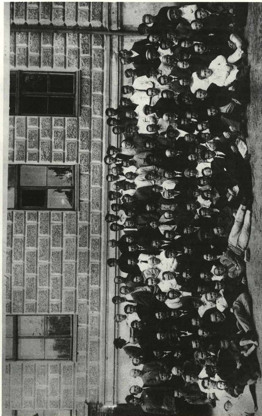
Group photograph of students and teachers of the Institute of Red Professors in 1925.