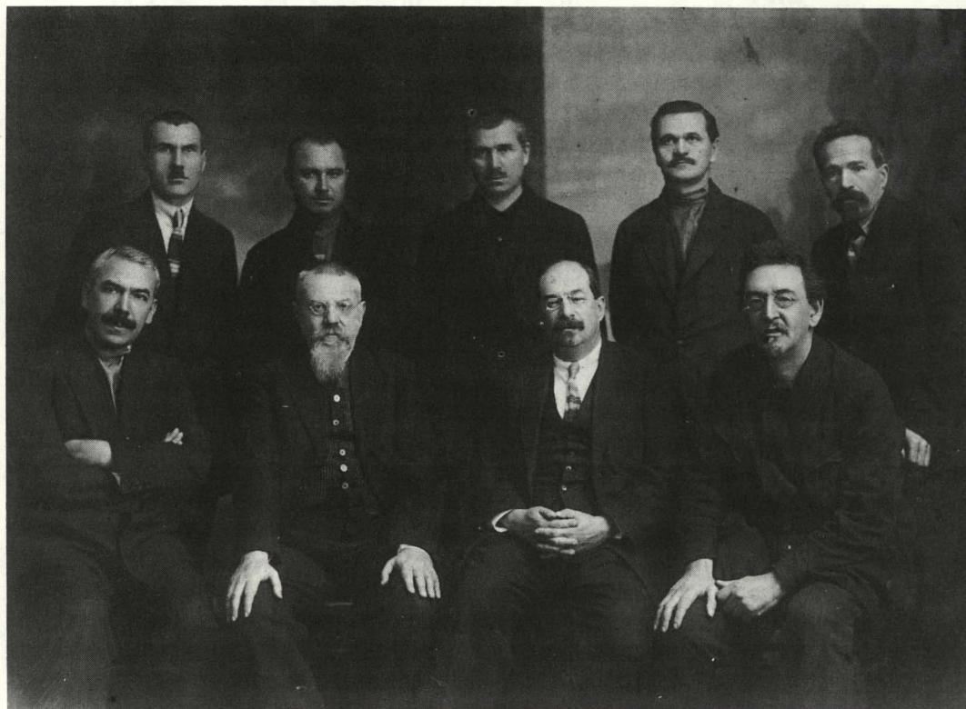
Mikhail Nikolaevich Pokrovskii, Anatolii Vasil'evich Lunacharskii, and Martyn Nikolaevich Liadov (first row, second, third and fourth from left respectively) with former students of the Capri School—the first Bolshevik party school, organized in Maxim Gor'kii's villa on the island of Capri in 1909 by the Vpered group of the Russian Social-Democratic Labor Party. The photo was taken in 1926.

rented by Inessa Armand in the one-street village south of Paris, were similarly divided into theory, tactical problems, current party life, and practical work. The practical training included such projects as producing a mock-up of a trade union journal. But if anything, the Longjumeau school was less concerned than its Vperedist counterparts with imparting the techniques and skills of the underground; as Ralph Carter Elwood notes, "Some of the students later criticized this lack of practical training." Of the major components initially included in party education—theory, practical training, and current politics—the Vperedist schools