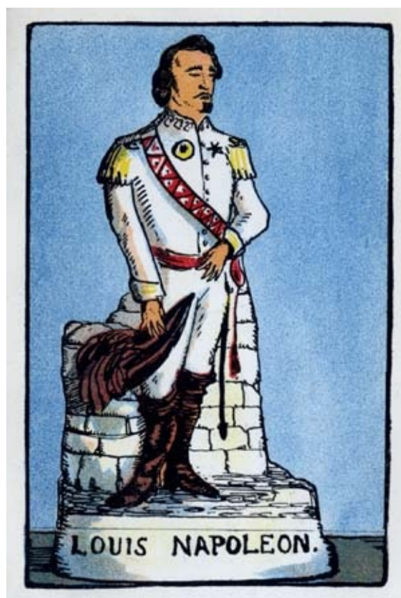
THE ZULU WAR

"I was in the army the time of the Zulu war. Great hardship we got in it and plenty of starvation. It was the Dutch called in the English to help them against the Zulus, that were tricky rogues, and would do no work but to be driving the cattle off the fields. A pound of raw flour we would be given out at seven o'clock in the morning, and some would try to make a cake, and some would put it in a pot with water and be stirring it, and it might be eleven o'clock before you would get what you could eat, and not a bit of meat maybe for two days."