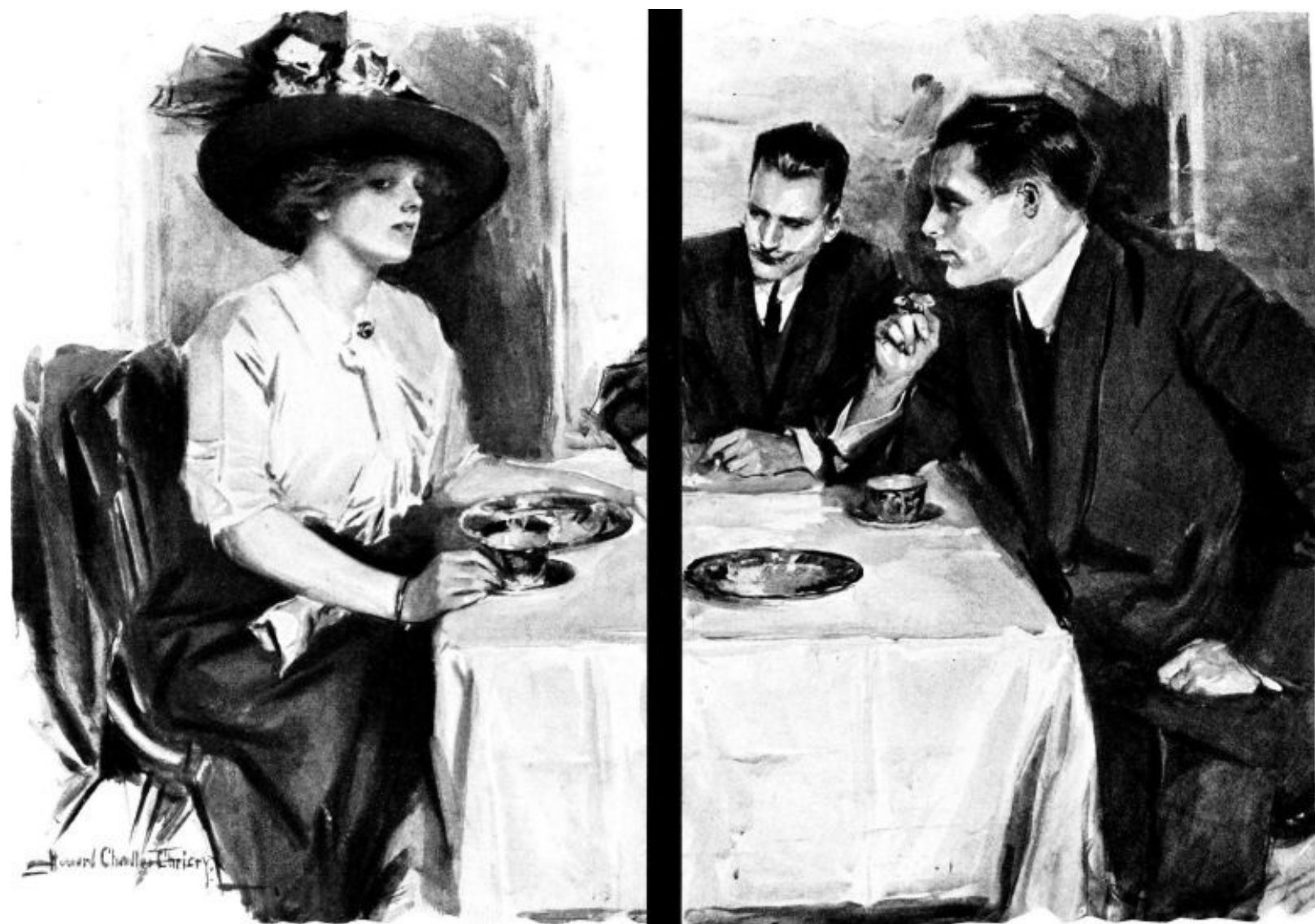
The engineer made generous terms across the dinner-table.

"I suppose," said the engineer hopefully, "that you'll run out from time to time to see how things are getting on?"