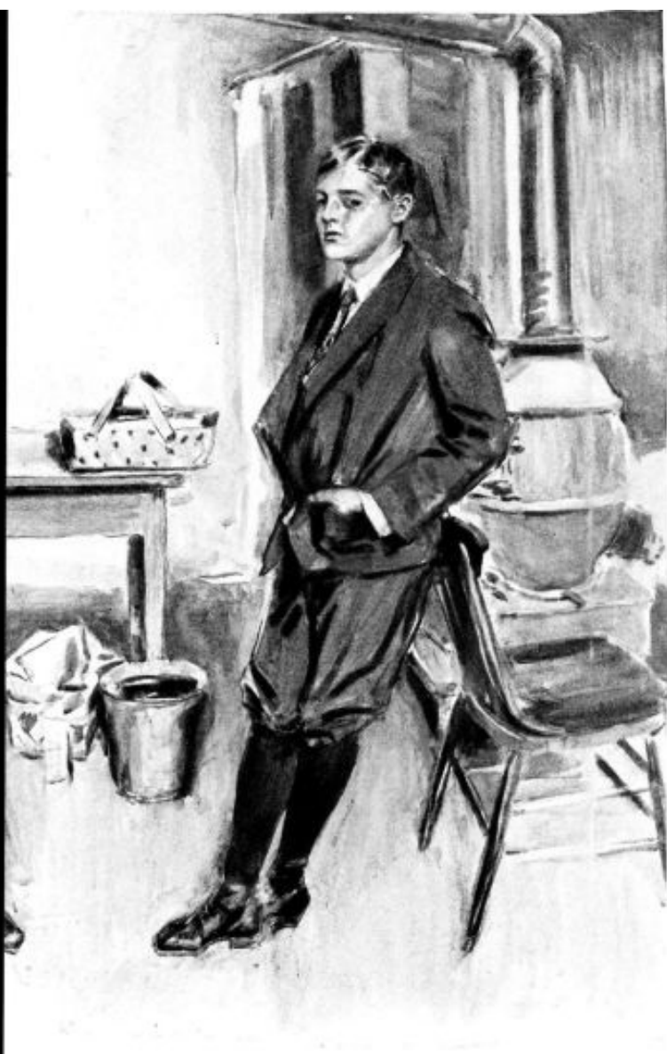
They were much amused with Bubbles, who came out to them for Christmas vacation.