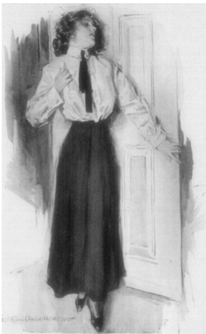
The door opened, and Rose staggered into the room.

Blizzard slid from his chair and secured her pistol. His face wore an expression of amused tolerance. "Tell me all about it," he said. "Crying can't do any good, and talking may. You hid in the closet to listen. It's not the first time. I found one of your combs, and saw where you'd brushed away the dirt so's not to spoil your dress. Now I'd like to know how much you know, and whom you've told it to?"