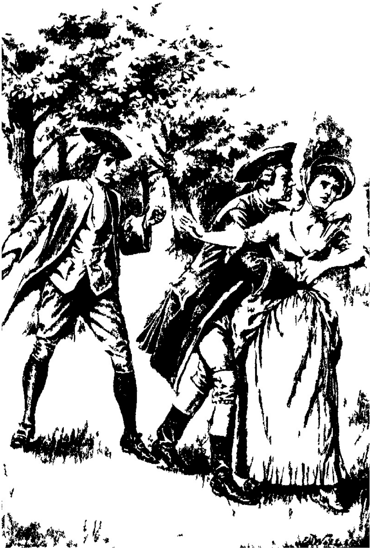
He ran towards her.

The trusty fellow, who was employed in an office he had been long accustomed to, discharged his part