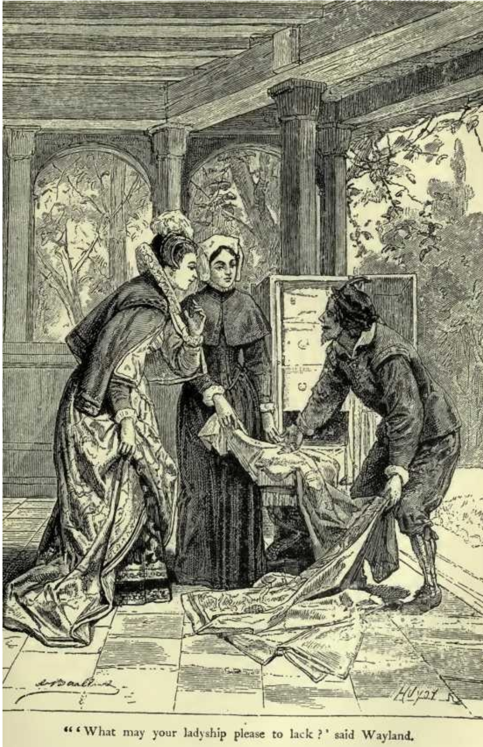
“What may your ladyship please to lack?” said Wayland.

“What may your ladyship please to lack?” said Wayland, unstrapping his pack, and displaying its contents with as much dexterity as if he had been bred to the trade. Indeed he had occasionally pursued it in the course of his roving life, and now commended his wares with all the volubility of a trader, and showed some skill in the main art of placing prices upon them.