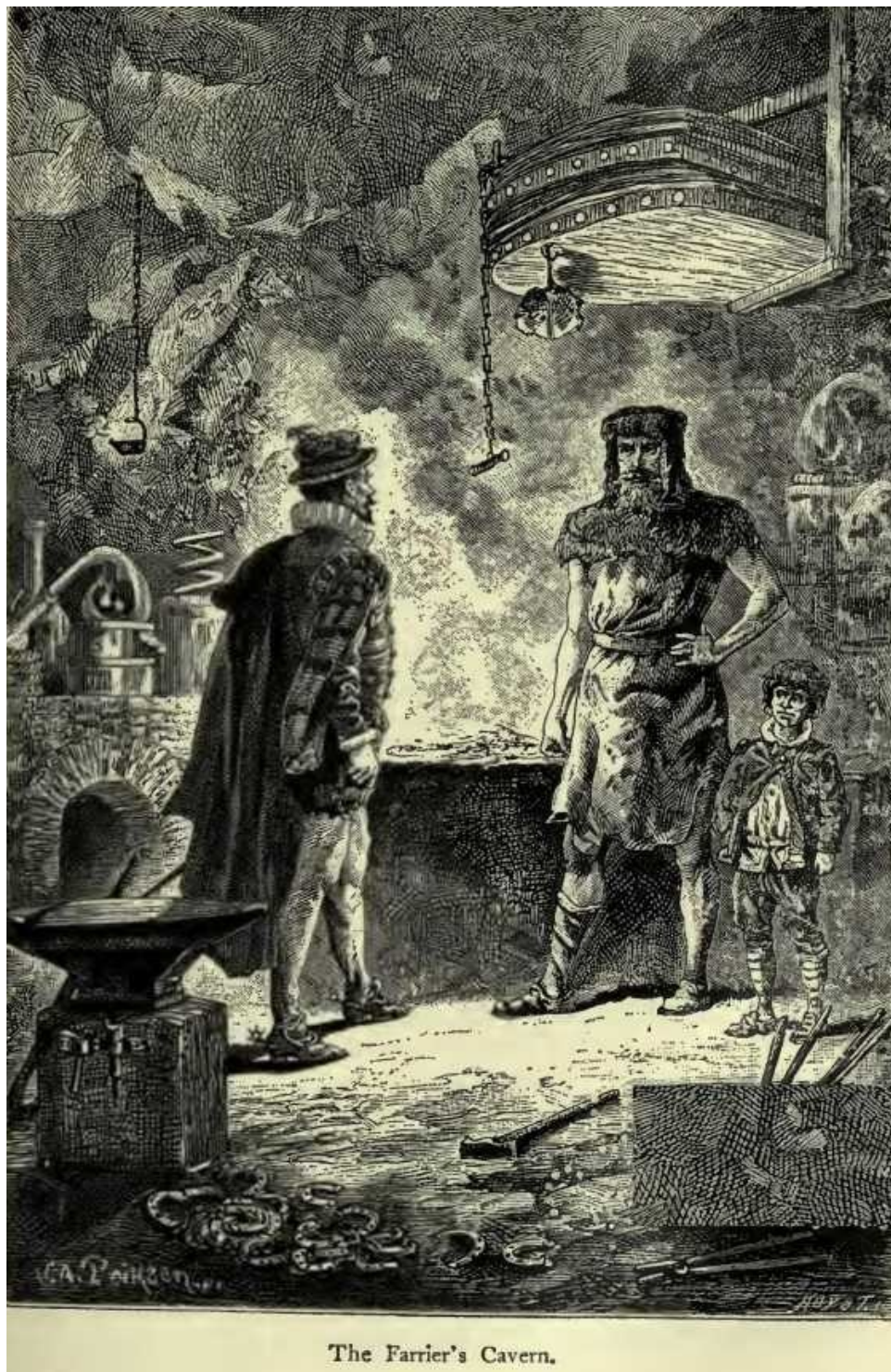
The Farrier's Cavern.

slight tremor, he became convinced that the whole was a concerted stratagem, and determined to know by whom, or for what purpose, the trick was played off.