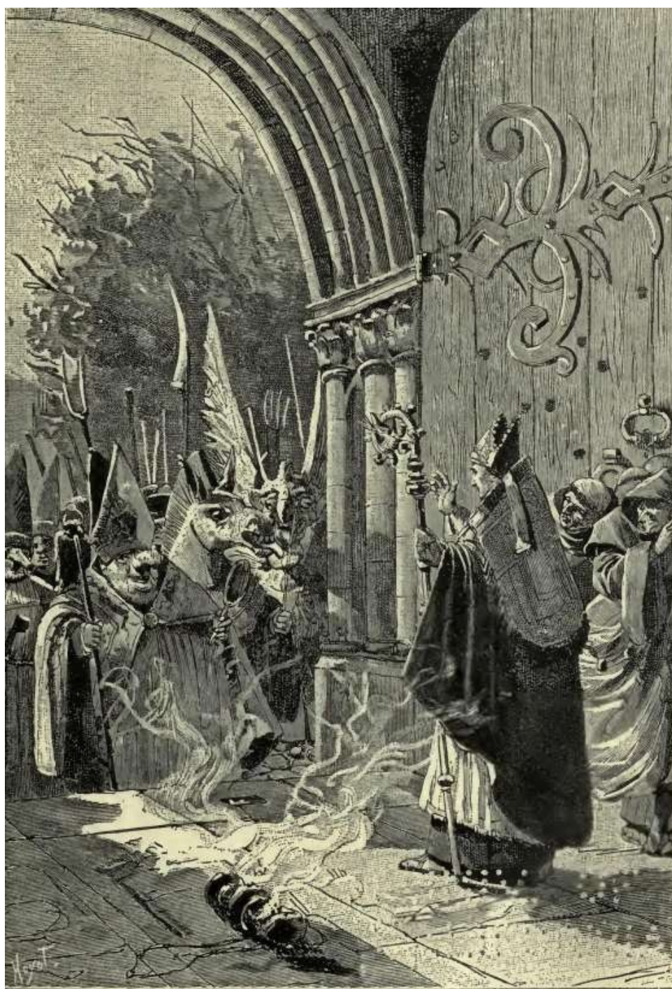
“The appearance of the crowd was grotesque in the extreme.”