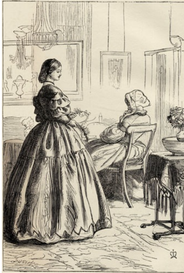
MRS. GRESHAM AND MISS DUNSTABLE.

"Well, my dear, I am heartily glad we've done with that," Miss Dunstable said to her, as she sat herself down to her desk in the drawing-room on the first morning after her arrival at Boxall Hill.