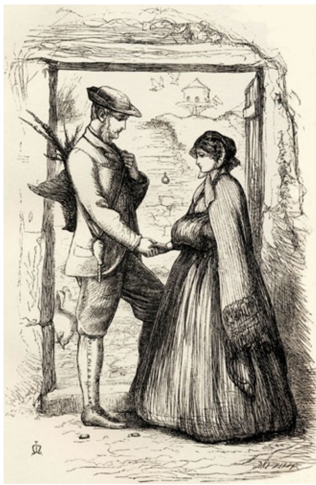
LORD LUFTON AND LUCY ROBARTS. Click to ENLARGE

"You have been here a long time," he said, "without our having had the pleasure of seeing you."