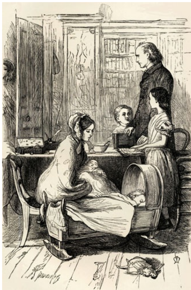
THE CRAWLEY FAMILY. Click to ENLARGE

"This is my sister-in-law, Lucy," said Mrs. Robarts. "Pray don't move now, Mrs. Crawley; or if you do, let me take baby." And she put out her arms and took the infant into them, making him quite at home there; for she had work of this kind of her own, at home, which she by no means neglected, though the attendance of nurses was more plentiful with her than at Hogglegstock.