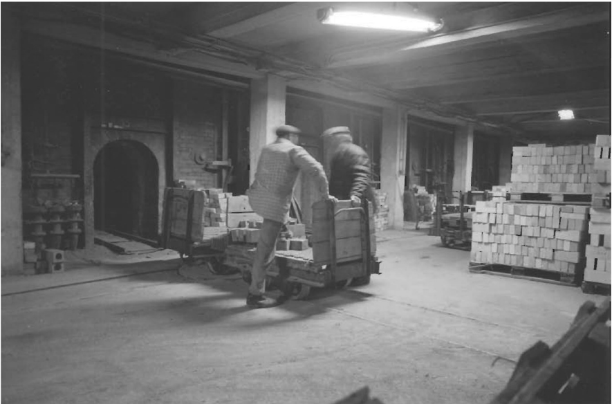
These brick-drying kilns provided the best protection from the icy winds.

One night I lay hidden inside a large warehouse used for storing timber, which was kept locked for the night. I was up in the loft, just below the eaves, resting on a stack of timber boards and trying to settle down, curled up with my knees drawn. From there, I was able to observe the outside through a small window. I was dozing restlessly, waiting for dawn to break, mindful of any sign of danger. Somehow, I had a gut feeling that perhaps I should not have chosen this place on this particular night.