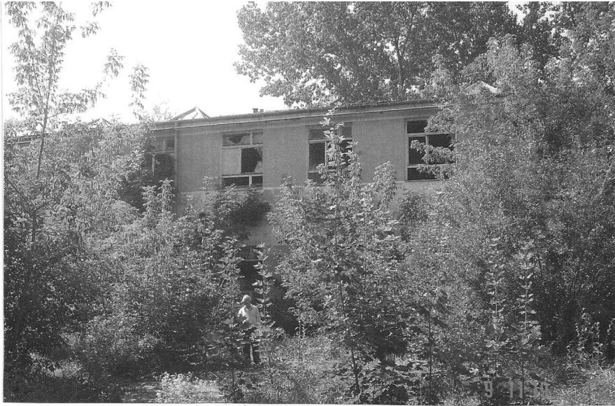
Standing in front of our former factory building as it looks today: empty and derelict neglected grounds, condemned for demolition to make way for a new development

owed my life. But Mother implored me to go while I had the opportunity, to go “where you can acquire some schooling and the good English manners you sorely need” as she liked to say. Although I was apprehensive about separating again, I was happy at the prospect of leaving Poland, where we didn’t feel safe. I had no way of knowing what life had in store for me, on my own in a strange land where I didn’t speak the language. Any place had to be better than post-war Poland, where we no longer fitted in and were not wanted. Ostrowiec, and all of Poland, had become afflicted with anti-Jewish hatred as never before. There was also an ideological struggle for power going on in the country: Pole against Pole, Left against Right, and vice versa, with Jews caught in the middle and held in contempt by both parties.