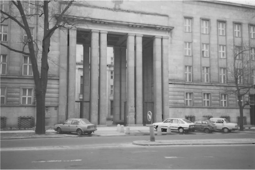
The former Aleja Szucha Gestapo Headquarters in Warsaw