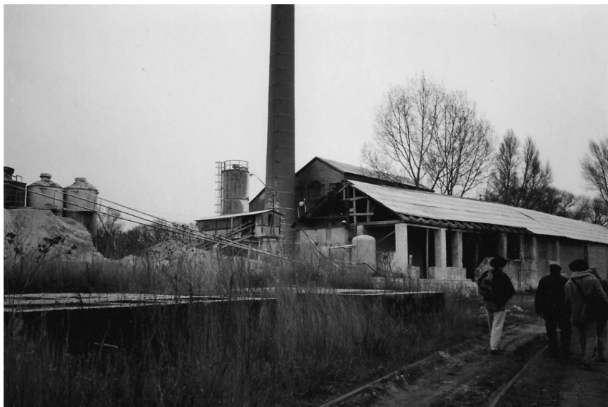
In this image, I am exploring the brickyard with my family, pointing out the different places I hid in during the war.