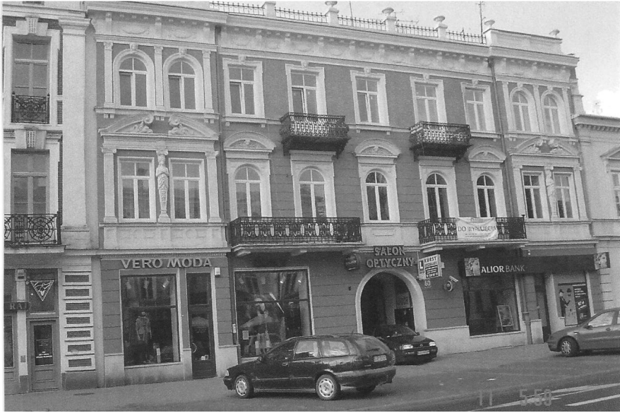
The Jewish orphanage in Lublin was housed in this imposing building.