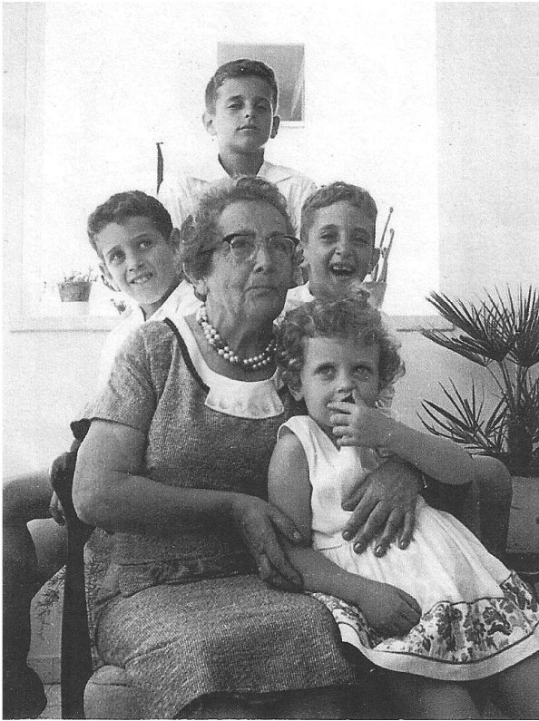
My mother in Israel in 1963. She was always at her happiest when surrounded by her grandchildren.

spoken after a funeral: “Blessed be the True Judge.” It was only days before the liberation.