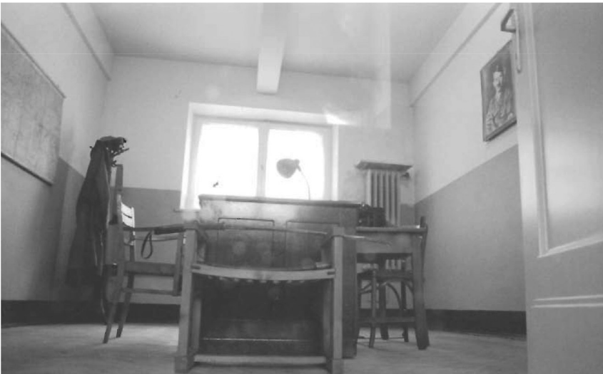
An interrogation room at Aleja Szucha Gestapo Headquarters, now the Museum of Martyrdom. A portrait of Adolf Hitler hangs on the wall with torture instruments resting on the table and chair.