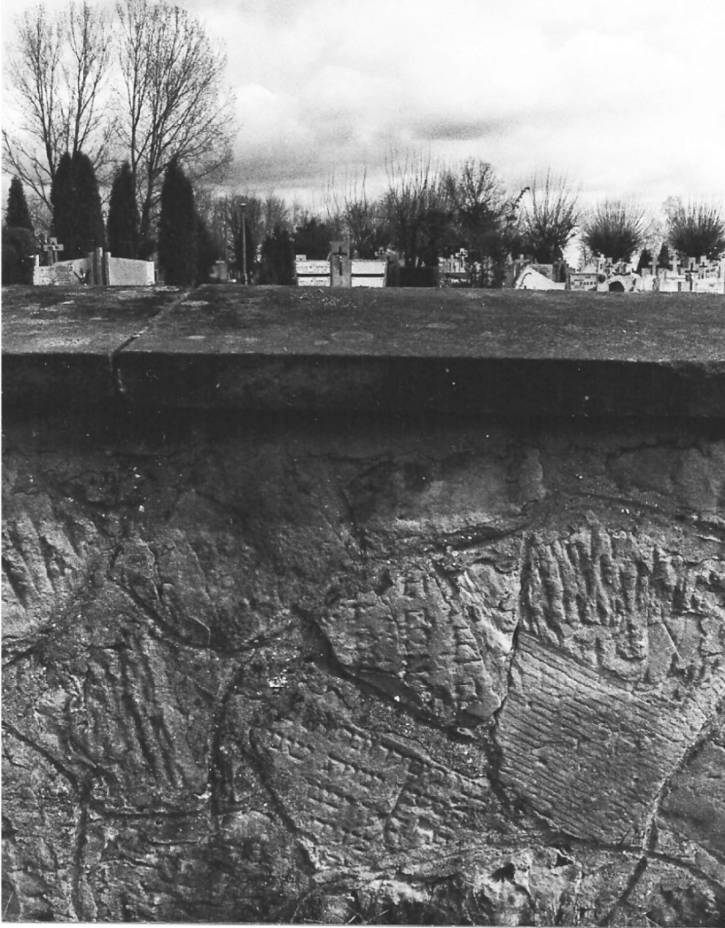
The perimeter wall of the Catholic cemetery in Ostrowiec, built with broken-up headstones taken from the Jewish cemetery, with the Hebrew inscriptions clearly visible.

trial to testify against him, but Mother declined to set foot in Poland, saying, “I cannot go back to the place of Jewish martyrdom and tread the very soil that’s steeped in Jewish blood.”