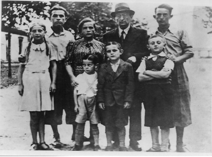
Family snapshot taken outside our home in the summer of 1937.

I was the youngest, aged six at the time