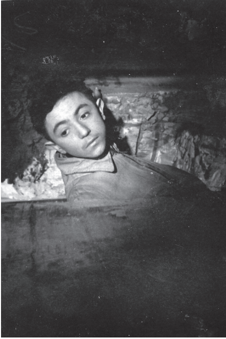
12. Author as child actor in the Yiddish film Undzere Kinder ( Our Children ) — Lodz, 1948.