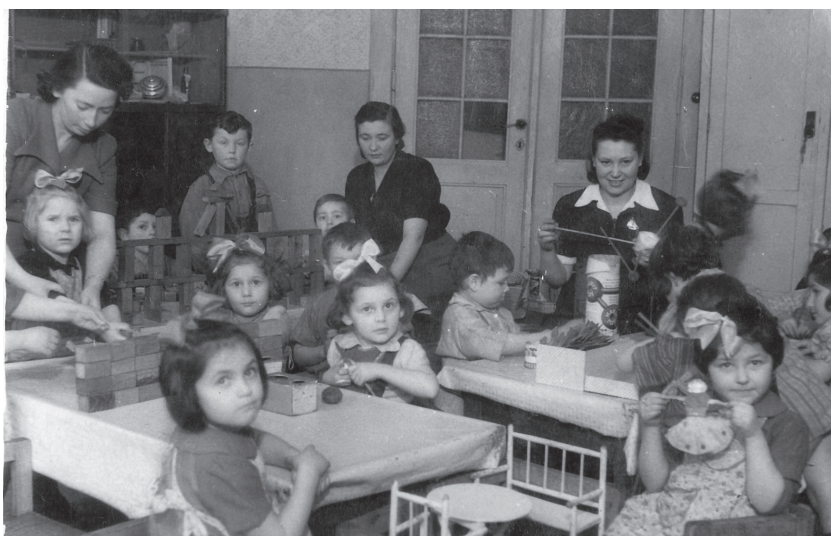
24. At the Koordynacja children's home on 88 Piotrkowska Street in Lodz.