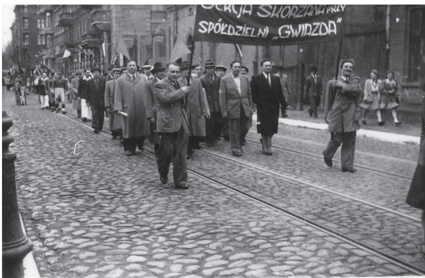
16. Members of a Jewish leather products cooperative in a 1st of May demonstration in postwar Łódź.