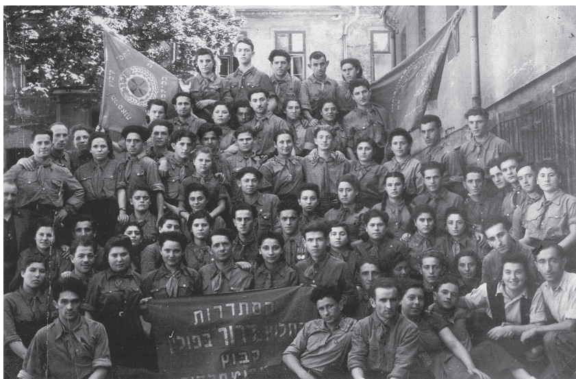
25. A Dror kibbutz in postwar Lodz.