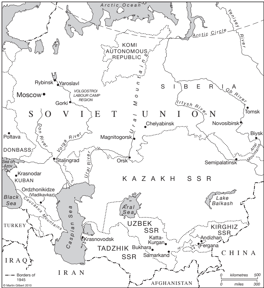
The Soviet Union, showing the locations mentioned in this book.