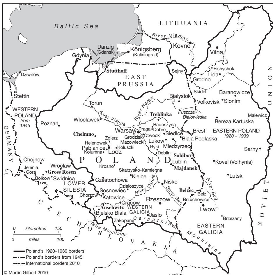
Wartime and postwar Poland, showing the locations mentioned in this book.