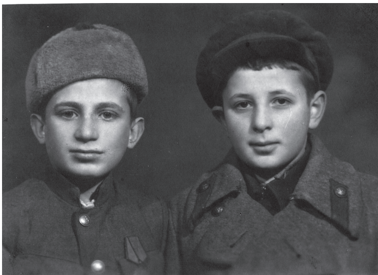
18. Children-partisans in the Jewish children's home in Helenowek.