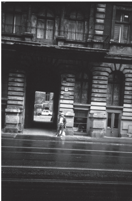
1. Author at the entrance to 49 Kilinskiego Street, Lodz, April, 1987.