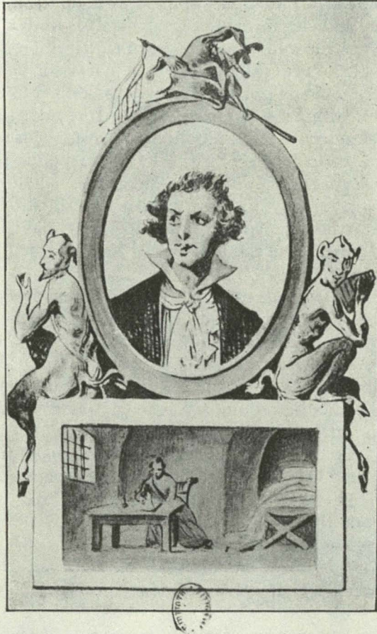
Portrait fantaisiste du Marquis de Sade gravé à l'époque de la Restauration.