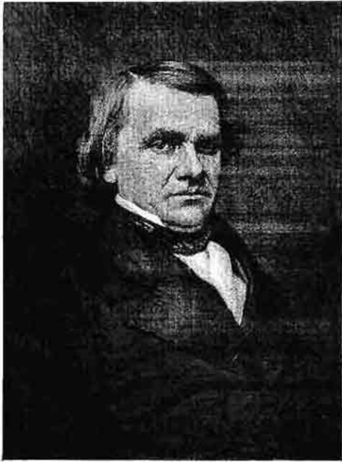
Stephen A. Douglas