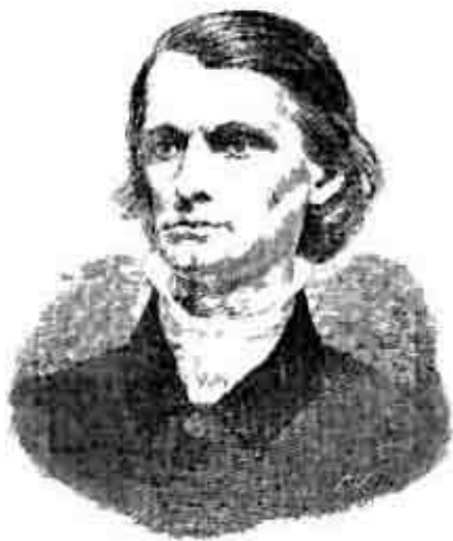
General Henry A. Wise

The letter was everywhere copied, its author denounced, and his proposal to "precipitate the Cotton States into a revolution" held up to public execration. Mr. Yancey immediately printed a statement deploring the betrayal of personal confidence in its publication, and to modify [2] the obnoxious declaration by a long and labored argument. But in the course of this explanation he furnished additional proof of the deep conspiracy disclosed by the "Scarlet Letter." He made mention of "A well-considered Southern policy, a policy which has been digested, and understood, and approved by the ablest men in Virginia, as you yourselves must be aware," to the effect that while the Cotton States should begin rebellion, "Virginia and the other border States should remain in the Union," where, by their position and their counsels, they would form a protecting barrier to the proposed separation. "In the event of the movement being successful," he continued, "in time Virginia and the other border States that desired it could join the Southern Confederacy."