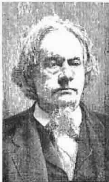
General Robert Toombs

Mr. Brown, of Mississippi, said the accumulating wrongs of years had finally culminated in the triumph of principles to which they could not and would not submit. All they asked was to be allowed to depart in peace.