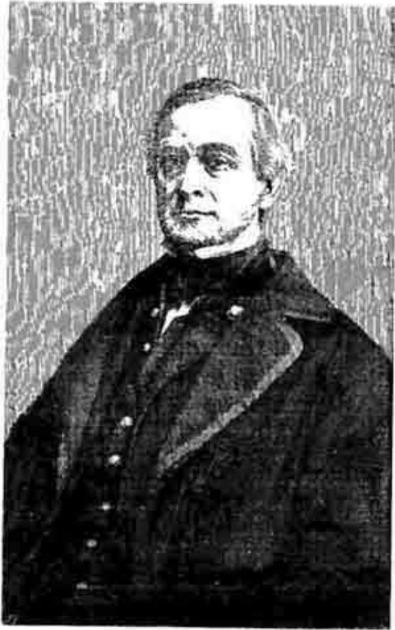
General Robert Anderson

Being in such intimate relations and intercourse with the leaders of the Breckinridge wing of the Democratic party during the progress of the Presidential canvass, and that party being made up so exclusively of the extreme Southern Democrats, the President must have had constant information of the progress and development of the disunion sentiment and purpose in the South. He was not restricted as the other parties and the general public were to imperfect reports and doubtful rumors current in the newspapers.