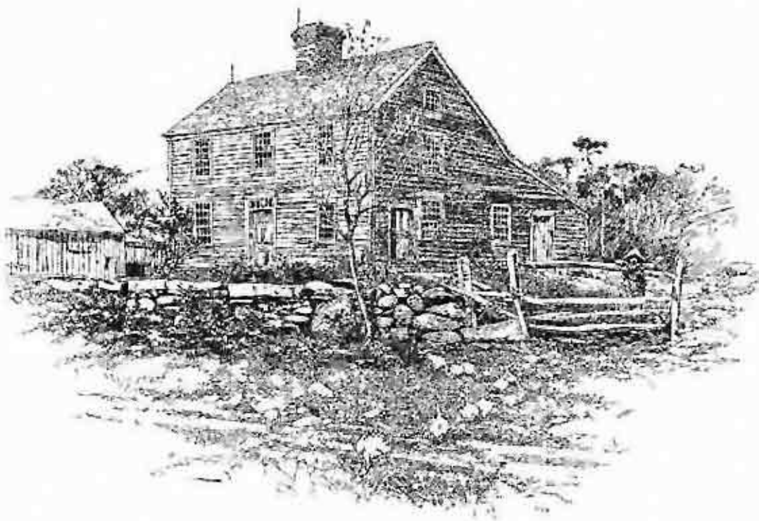
House in which John Brown was born, Torrington, Connecticut