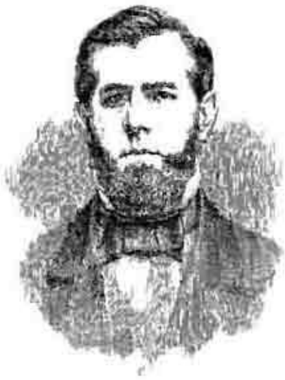
David Colbreth Broderick

David Davis to Lincoln, Nov. 7, 1858. MS.