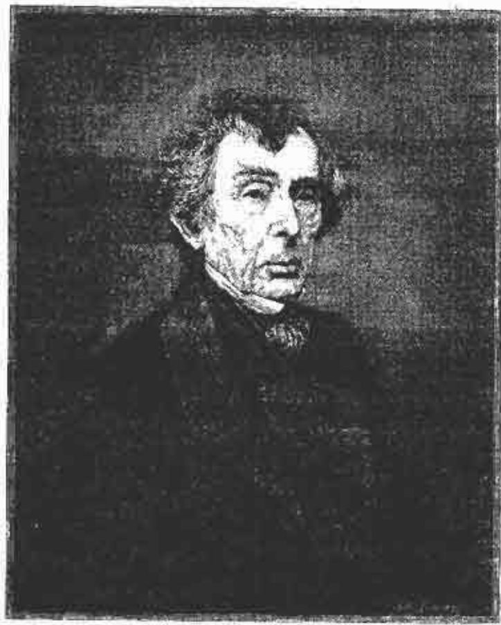
Roger B. Taney

The Presidential election came, and Mr. Buchanan was chosen. Soon after, the court met to begin its long winter term; and about the middle of December, 1856, the Dred Scott case was once more elaborately argued. Again occupying the attention of the court for four successive days, as it had also done in the first hearing, the eminent counsel, after passing lightly over mere technical subtleties, discussed very fully what was acknowledged to be the leading point in the controversy; namely, whether Congress had power under the Constitution to prohibit slavery in the Federal Territories, as it had done by the Missouri Compromise act and various other laws. It was precisely the policy, or impolicy, of this and similar prohibitions which formed the subject of contention in party politics. The question of their constitutional validity was certain to take even a higher rank in public interest.