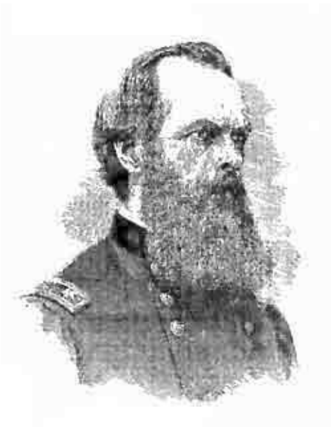
General John W. Geary