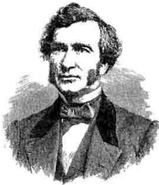
Justin S. Morrill