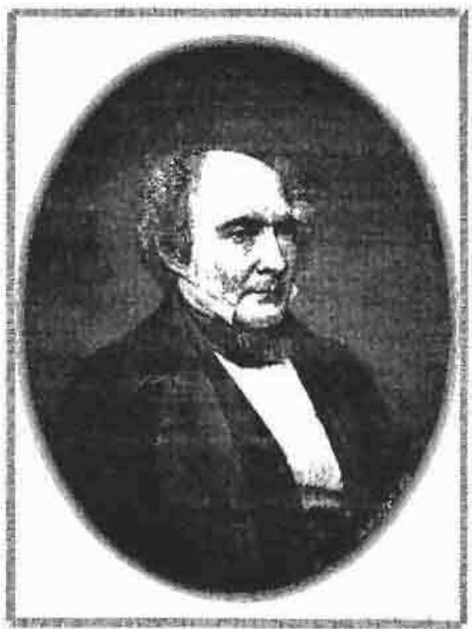
Robert J. Walker

Walker, Topeka Speech, June 6, 1857, in "Washington Union" of June 27, 1857.