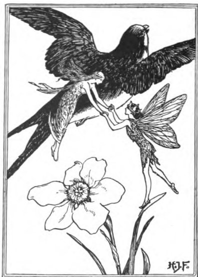
He helped her to jump from the Swallow's back

'Twit! twit,' cried a voice just above her; and the swallow fluttered to the ground beside her. 'You look