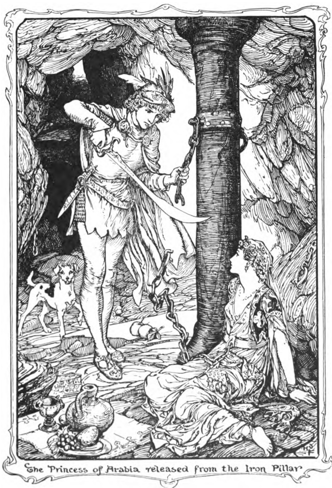
The Princess of Arabia released from the Iron Pillar