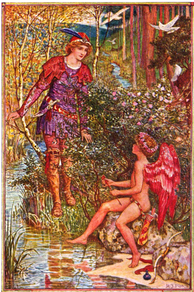
THE BOY IN THE VALLEY