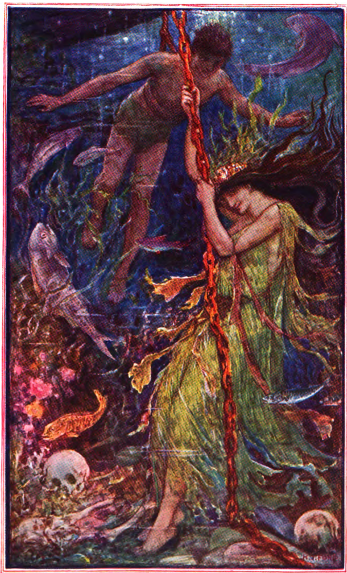
THE SEA-MAIDEN WITH A WICKED FACE