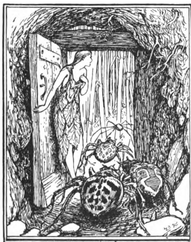
MAIA AND THE SPIDERS IN THE EVENING

'Oh, not so soon! not so soon!' cried Maia, bursting into tears; which made the field-mouse very angry, and