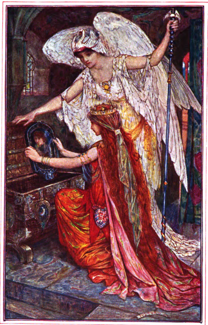
THE BLUE PARROT.