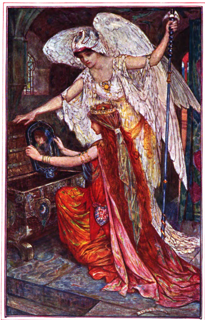
THE BLUE PARROT.