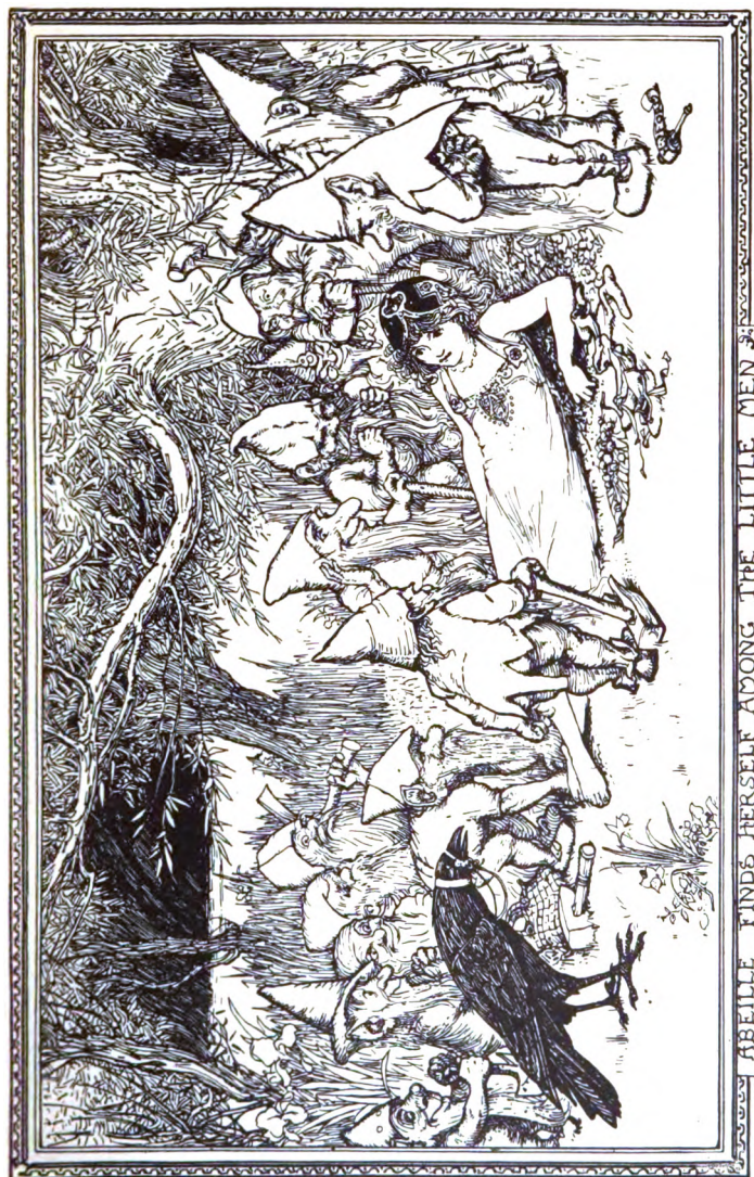
ABEILLE FINDS HERSELF AMONG THE LITTLE MEN 3.