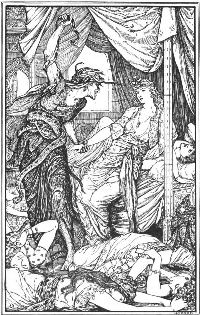
The Witch and her Snakes