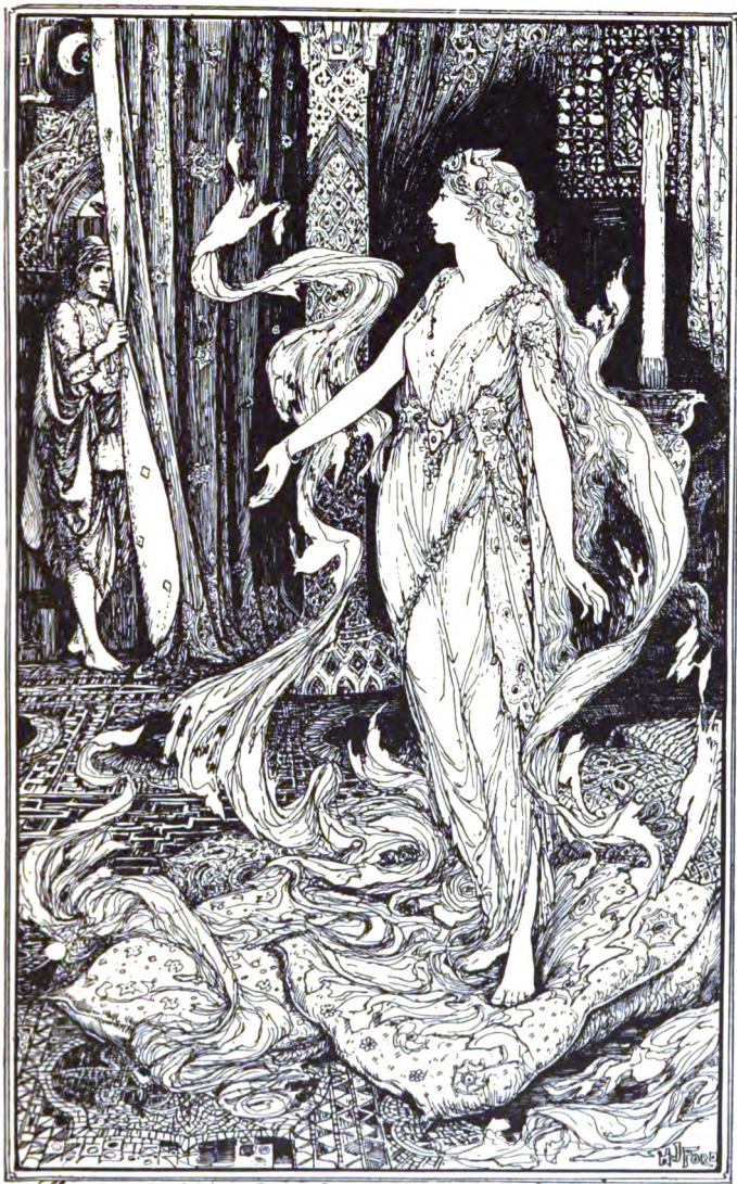
"The Seven Veils fell from her."