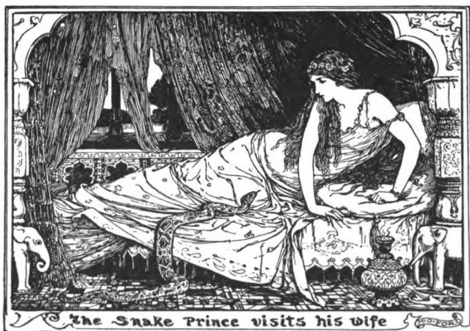
The Snake Prince visits his wife

For several months they lived together; and it was not such a happy time for either as it ought to have been, for the secret was still a secret, and lay between them like a cloud between the sun and the earth, making what should be fair, dull and sad.