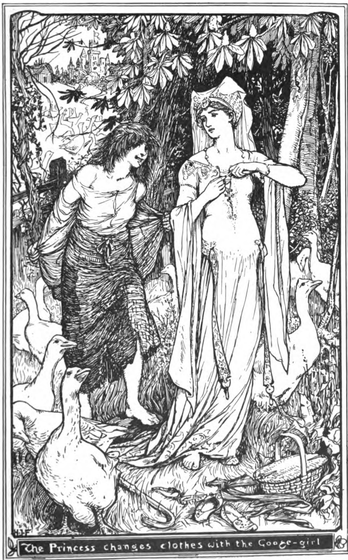
The Princess changes clothes with the Goose-girl