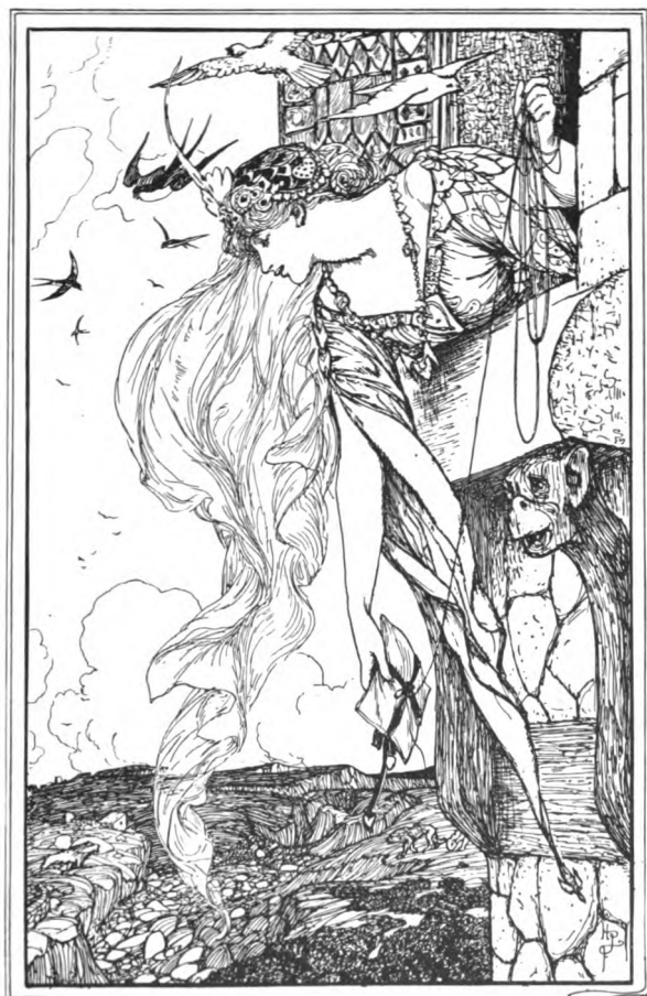
The Princess GATS HAR LATTAR