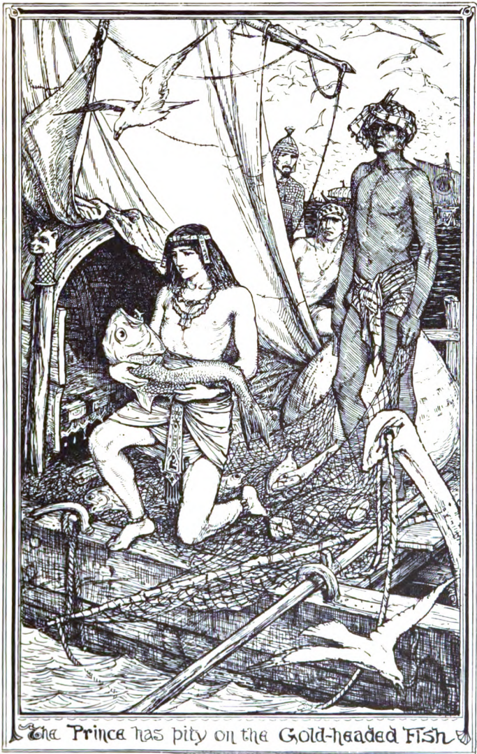
The Prince has pity on the Gold-headed Fish