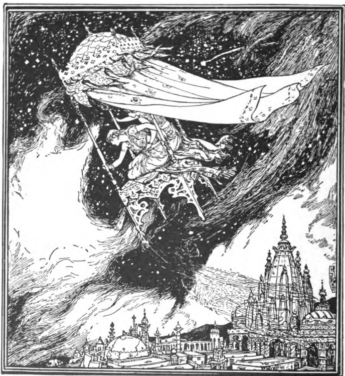
THE INVISIBLE PRINCE GOES WITH THE LADIES

gave the signal to cease; and again the two women seated themselves on the stool, and, with the prince clinging to the leg, it flew back to earth, and bore Dorani and her husband safely to the scent-seller's shop. Here the prince