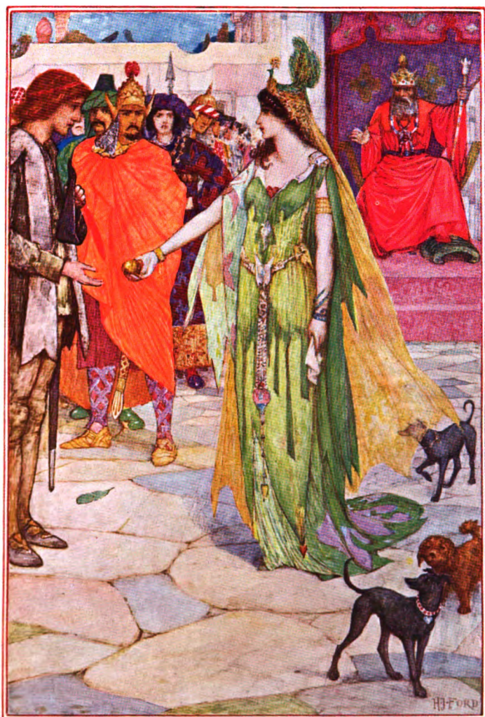
♥ THE PRINCESS CHOOSES ♥