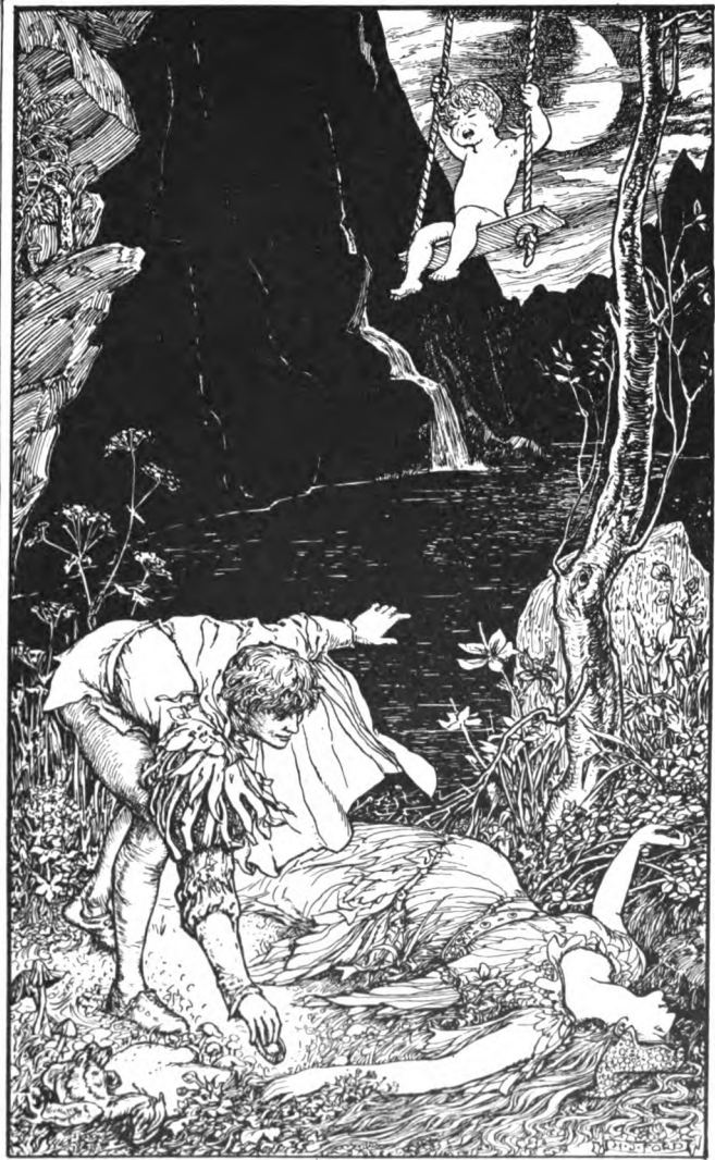
SHE BOY SECURES THE BRACELET