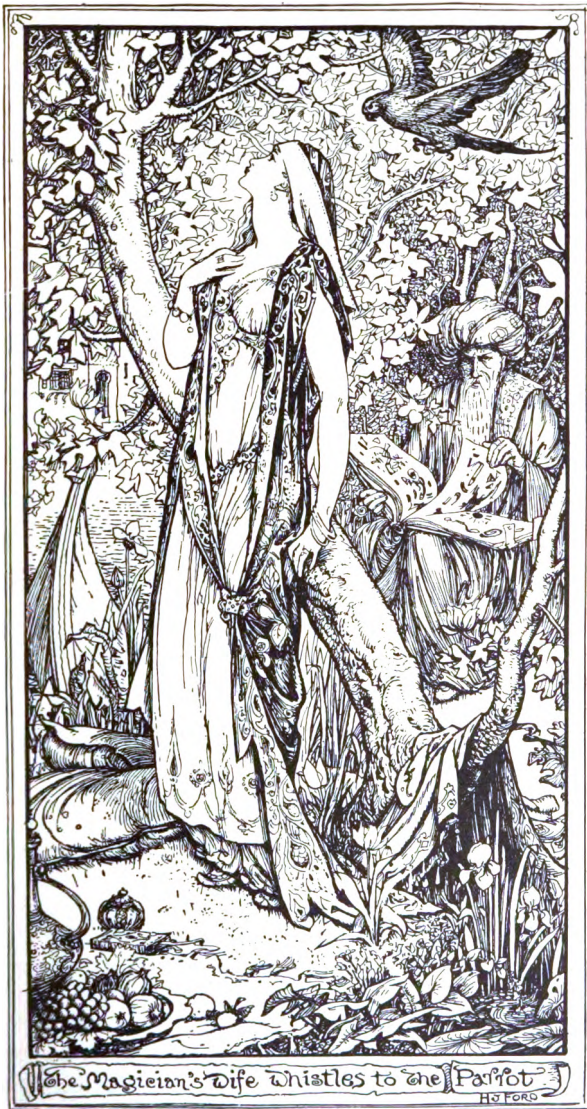
The Magician's Wife Whistles to the Parrot