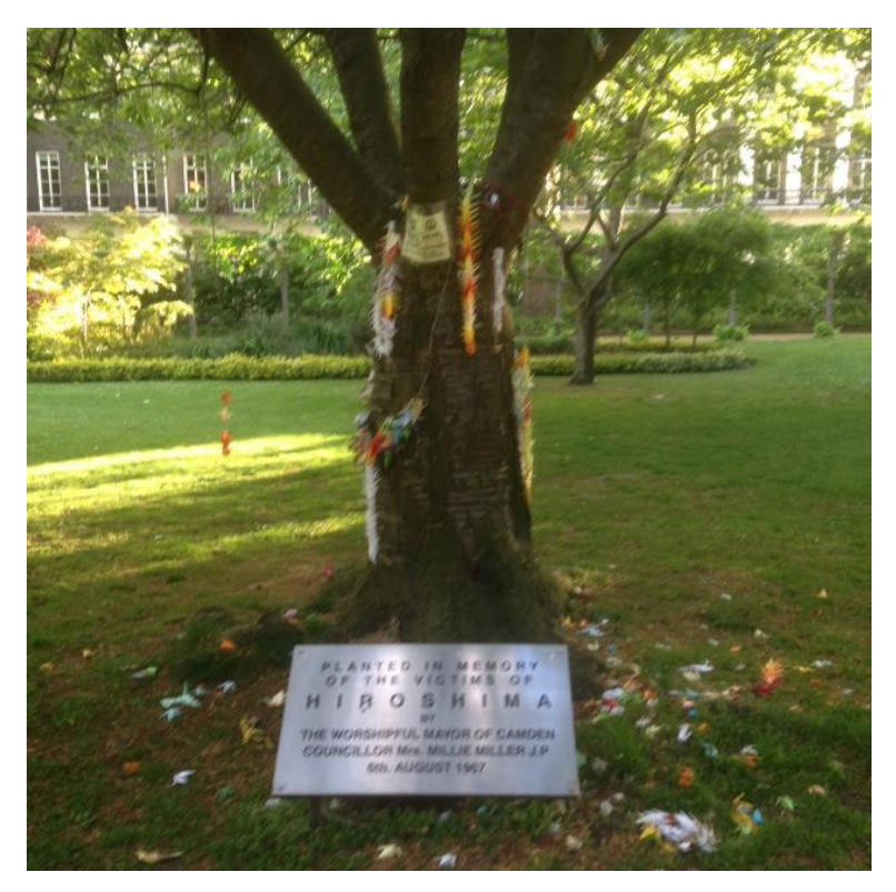
Figure 11: Hibakusha Memorial Tree, 1967, Tavistock Square, London, another symbol of the global presence of hibakusha memorialisation in a world city.

unite the different sites of commemoration that stemmed from the tragedies of the Second World War.<sup>480</sup> Yet the equation of the atomic bombings with the deliberate industrialised incineration, gassing and torture of 6 million Jewish people by the Nazi regime was by no means convincing. And of course, both Germany and Japan were former Axis partners.