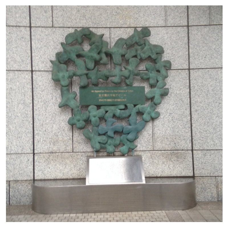
Figure 12: Anti-war sculpture in the plaza of the Tokyo Metropolitan Government Building, designed by Kenzo Tange. The inscription reads 'An appeal for peace by the citizens of Tokyo'.

In common with Bert Hardy in London, he was not going to let his fear get the better of him. The social historian Arthur Marwick