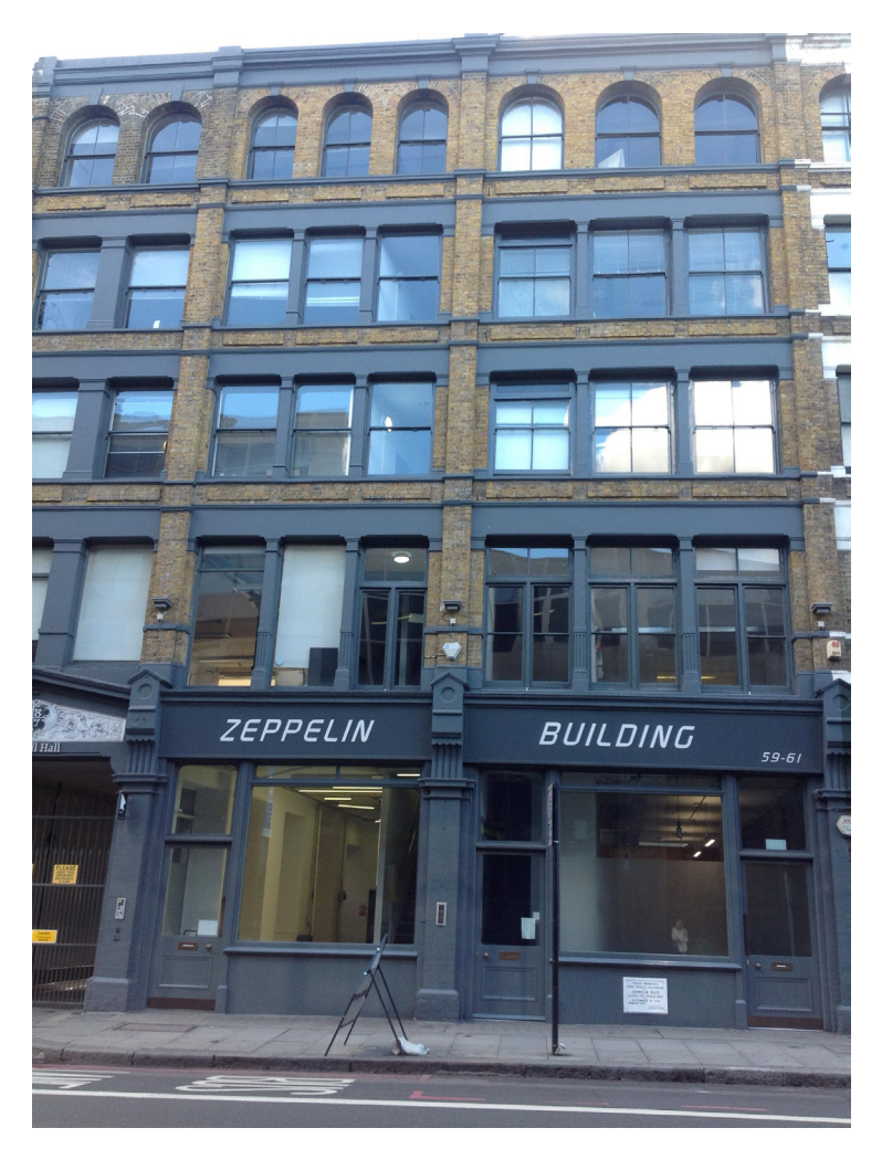
Figure 1: The Zeppelin Building, Farringdon, East-Central London (photograph by author, 2017).

further west. London was an obvious objective for the Germans, however. The air raids in the First World War drew an early pattern of incursion and destruction that would be more widely replicated in the Second World War. Among the first areas of London