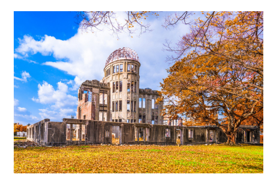
Figure 10: Peace Dome, Hiroshima.

The Pavilion was a fusion of both modern architecture with influences from Le Corbusier, and traditional motifs drawn from Japanese culture.<sup>468</sup> In a sense it encapsulates the modern-traditionalist tension in many other reconstruction projects, yet resolves them, unlike many other major undertakings. The HMPP has been the major national and international focus of remembrance of the victims of atomic bombing in Japan, drawing hundreds of thousands of visitors every year.