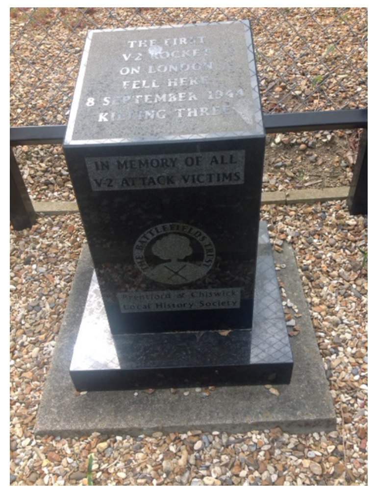
Figure 5: V2 Memorial, Chiswick, West London.