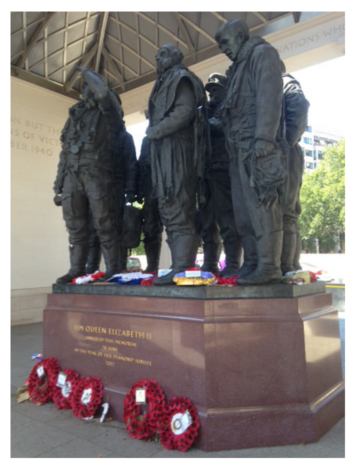
Figure 9: The Bomber Command Memorial, Green Park London. In addition to the 55573 air crew killed, the memorial also commemorates 'those of all nations who lost their lives in the bombing of 1939–1945'. Hence it reflects the globalisation of memorialisation (photograph by author, 2018).

former enemies. It received less condemnation than the statue to Arthur Harris.<sup>459</sup>