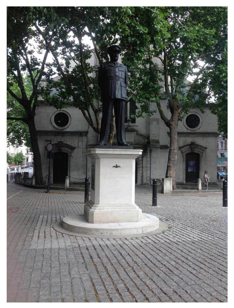
Figure 6: Statue to Sir Arthur Harris, St. Clement's Danes, Aldwych, London. The inscription reads: 'In memory of a great commander and of the brave crews of Bomber Command, more than 55,000 of whom lost their lives in the cause of freedom. The nation owes them all an immense debt'.