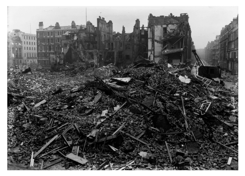
Figure 3: Bomb damage to Hallam Street, London.

across roads and streets. During the first weeks of the Blitz the physical destruction and the accumulation of debris was so extensive that about 1,800 roads were blocked, while over 3 million tons of rubble and detritus had built up, requiring an extensive clearing-up and repair operation to the infrastructure of the capital city.<sup>70</sup> Barrage balloons had done little to stem the tide of German attacks, and the air raid warning siren was no longer sounding for practice or to indicate a few lone bombers. To make matters worse, during the first two nights the anti-aircraft guns were largely impotent, unable to bring down large numbers of German aircraft, and even failing to fire properly in some installations. As Winston Churchill noted in his history of the Second World War, first published in 1959, when the anti-aircraft artillery finally launched its salvoes into the London night, many hud-