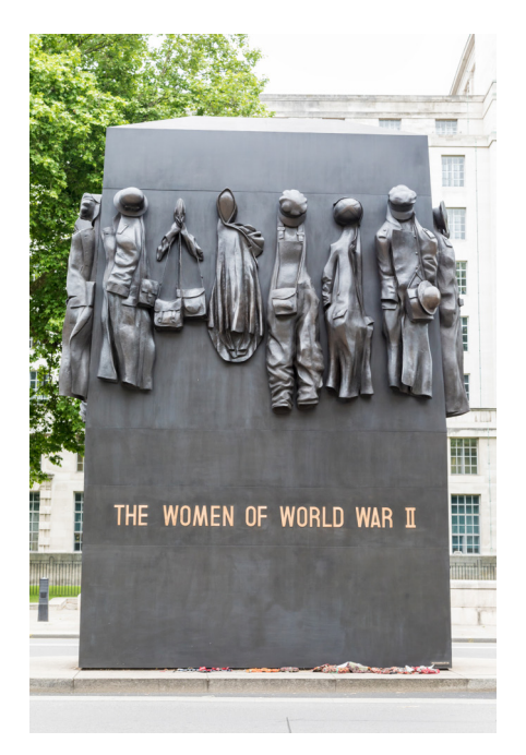
Figure 8: Monument to the Women of World War Two. (Photograph Jane Rix / Shutterstock.com).

Beyond London, the National Memorial Arboretum in Staffordshire hosts the Civil Defence Memorial Grove, which recognises