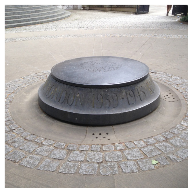
Figure 4: Memorial to the people of wartime London at St Paul's Cathedral.

counters that the survival of the cathedral means something, despite the desolation all around it: