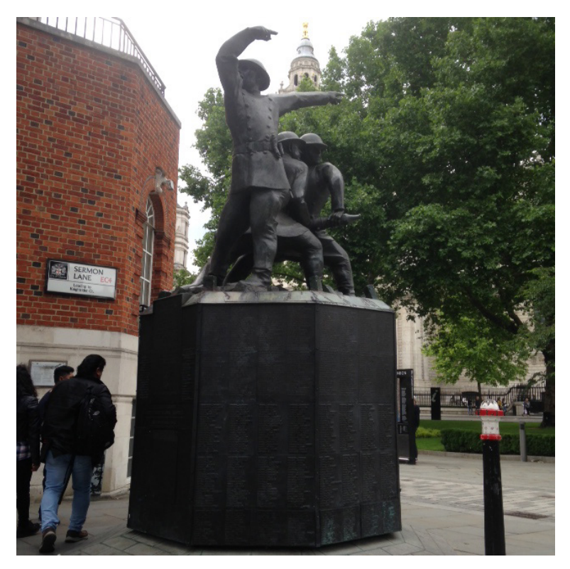
Figure 7: National Firefighter's Memorial, St. Paul's Cathedral London (photograph by author, 2017).

The heroism of the fire fighters and other members of the emergency services was the subject of some powerful documentary films made during the Second World War, as noted in chapter