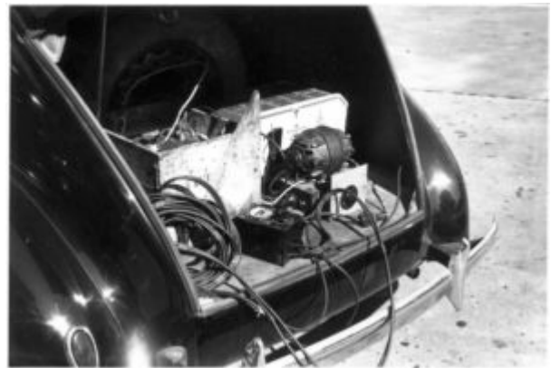
Lomax's recording machine was so large he had to remove the backseat of his car to put it in the trunk.

Although Lomax's work advanced the genre of the blues significantly, another matter to consider is that when Lomax submitted the printed transcriptions of the songs he recorded to Library of Congress, and because that library is the clearinghouse for all US copyrights, those songs were copyrighted under John Lomax's name. As owner of that intellectual property he was entitled any royalties for those songs. Very few of the musicians he recorded received a share of those proceeds.