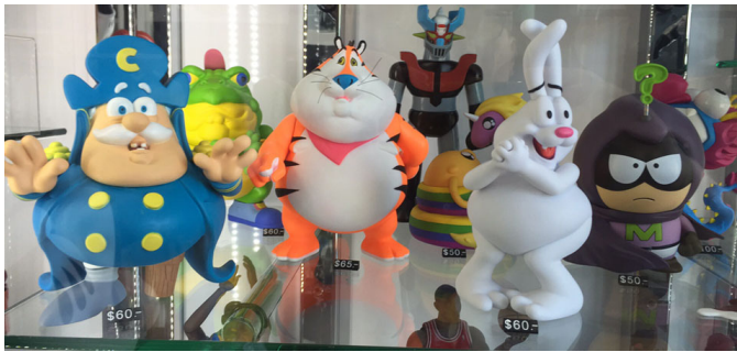
Ron English's "Cereal Killers"

While the Neo Expressionists were causing everything from excitement to worry in the art world, there were other voices that were drawn to the escapism of television entertainment, in MTV, Movie Channels, and the wealth of media that could be had on cable television. In Visual art, Neo Pop art was filled with political protest and sometimes satire.