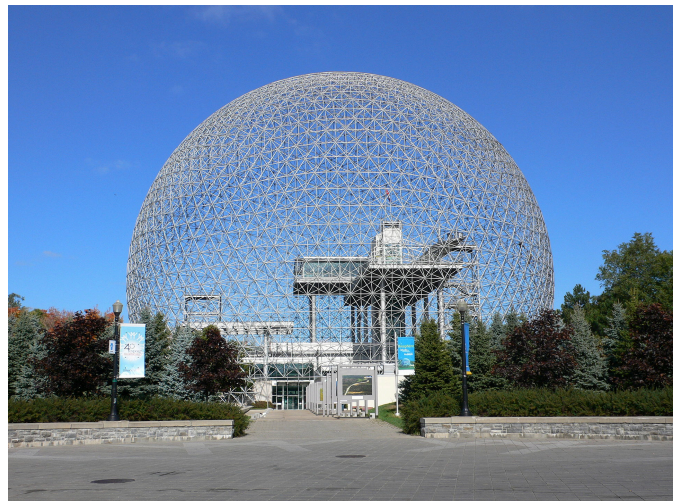
The former Expo 67 American Pavilion, designed as a Geodesic Dome, became the Montreal Biosphère, an environmental museum on Saint Helen’s Island.

In the 1970s, the American middle-classes were doing well. The push to reach beyond social conventions in the 1960s seemed to have taken hold and there seemed to be emerging a new consciousness where civil rights for people of color and gender equality had gotten a strong beginning. Furthermore the United States pulled out the controversial Vietnam War, and the draft was repealed. The United States enjoyed a robust and growing consumer economy, even with Wartime spending in Vietnam, there was more money to spend on items that were considered luxuries, including the Arts. Some artists and musicians began to turn from the consciousness-raising of protest to