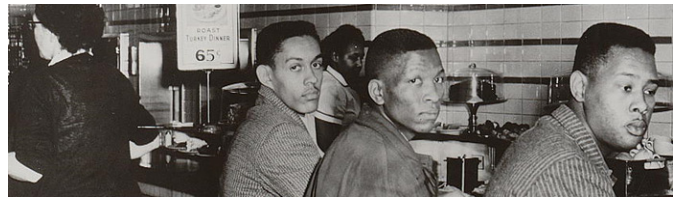
African Americans at a Lunch Counter reserved for White customers.

After World War II and into the 1960s, Americans were getting used to the idea of Blues and Rock and Roll, and by the 1960s, new changes shook things up and parent's worries about Elvis became the least of their worries. We have discussed how racial issues played out in the undercurrents of American mass media, but overall the music that sold the most was produced mainly as a form of happy entertainment.