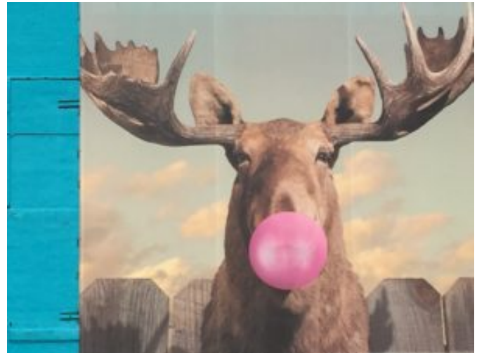
The “Moose Bubblegum Bubble” by Jacob Watts

Graffiti and Street Art are similar in many ways, but at times they follow separate paths, even when they co-exist on the same streets. They can be a reaction to the dehumanizing effect of abandoned walls and buildings, but its effects can also transmit signifiers of neighborhood community.