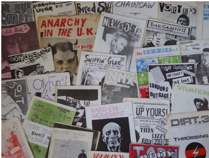
British punk fanzines from the 1970s

Neo-expressionism is a term given to an international art movement, which began in the 1960s and 1970s and developed into a dominant mode of art in the United States and Europe in the 1980s. The movement