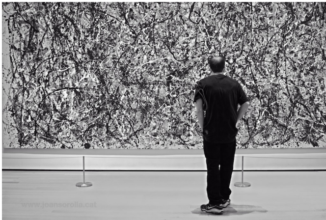
Jackson Pollock at the MoMA

Abstract Expressionism is a form of art (mainly painting) that developed after one of the most difficult periods in human history. This period began during the great depression in the 1930's and ended with the end of World War II in 1945. When the war ended, Germany, Italy and Japan had been defeated and much of Europe and Japan were in ruins. The human loss in the Nazi concentration camps had been exposed in all of its horror and the United States had dropped atomic bombs on two Japanese cities, unleashing destructive power of an unprecedented nature. All of this, of course brought about a worldwide examination of basic human values and ethics and a period of dramatic change in art.