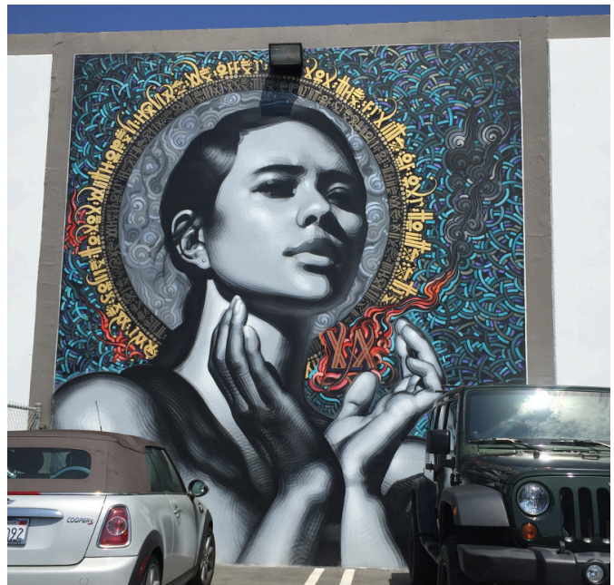
A mural by El Mac and Cryptic, Costa Mesa California.

In music, changes are similar. Musicians not only sing and play instruments, they also take on roles of performance artists, wherein hairstyles and costumes and other visual theatrics are just as important as the music they sing and play. Later in this chapter you will see a video by the musician Sia, who is known for the visual aspects of her performances.