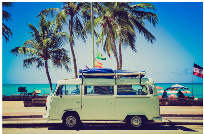
Surf van: embark on the surf trip of a lifetime

Surf Rock was a very popular form of Genre in the 1960s that was positioned to compete with softer genres of rock and roll and new British groups. Popular movies of Hollywood filled audience members’ imaginations with references to sunny California Beaches, surfing, hot rods, and summer paradise, as if to portray the lie off stage lives of singers like Elvis Presley and teen heartthrob actors, like Frankie and Annette Funicello . Surf Rock was characterized by reverberating guitar work, and massive instrumentals that sometimes sounded like the ocean. In terms of the range of sounds that it explored, it was revolutionary music for its time. Surf groups included the Beach Boys , the Chantays, the Surfaris, Jan & Dean, and Ronny & the Daytonas.