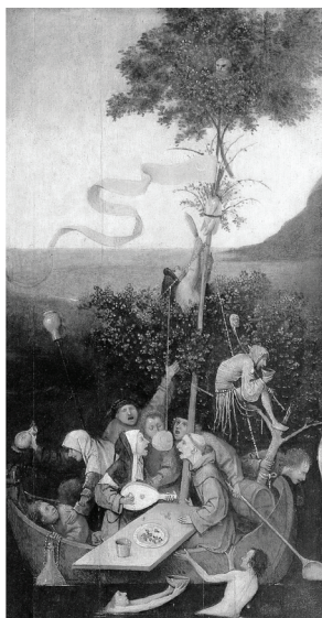
Fig. 1. Hieronymus Bosch, Ship of Fools (1490–1500)