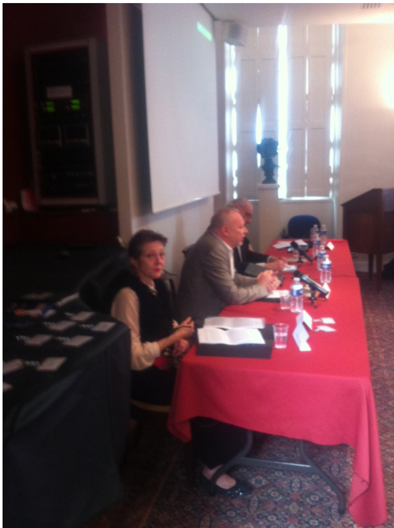
NZ at Tadeusz Kantor centennial conference, la Sorbonne, April 2015.