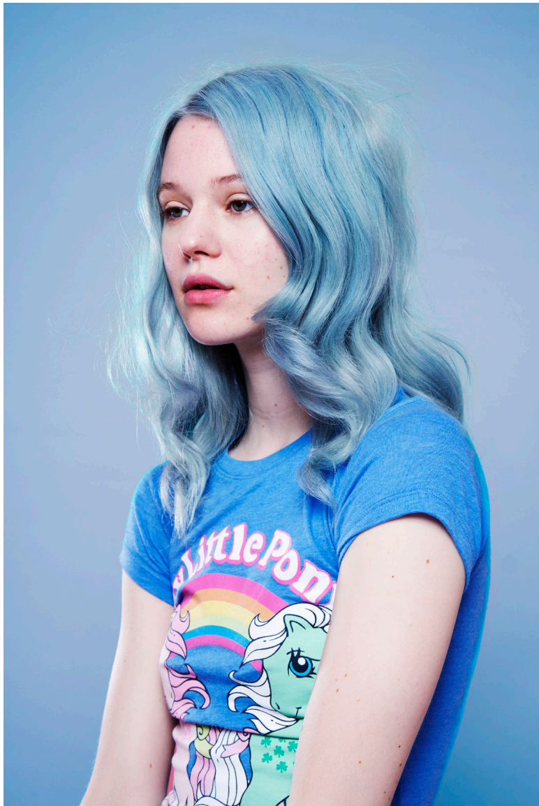
Arvida Byströms, Self-Portrait , 2014. From the series My Girl Lollipop .