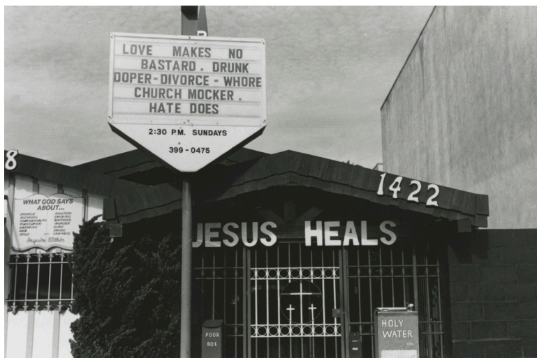
Nathan Lyons, from the sequence Riding 1st Class on the Titanic, 1974-1999.