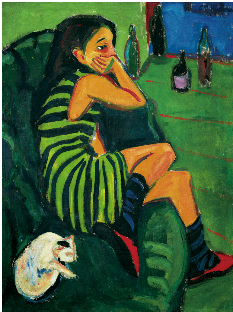
Ernst Ludwig Kirchner, Artistin Marcella , 1910.