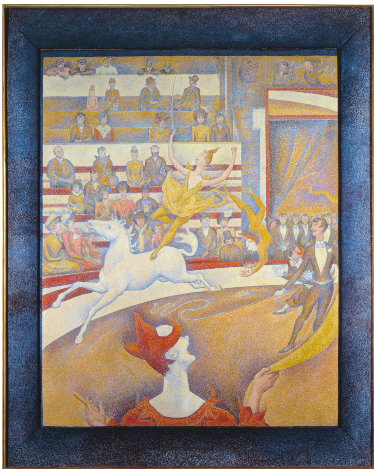
Georges Seurat, Le Cirque , 1890-91. Collection of the Musée d'Orsay, Paris.