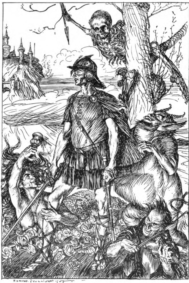
THE ORDER OF THE SAMURAI.