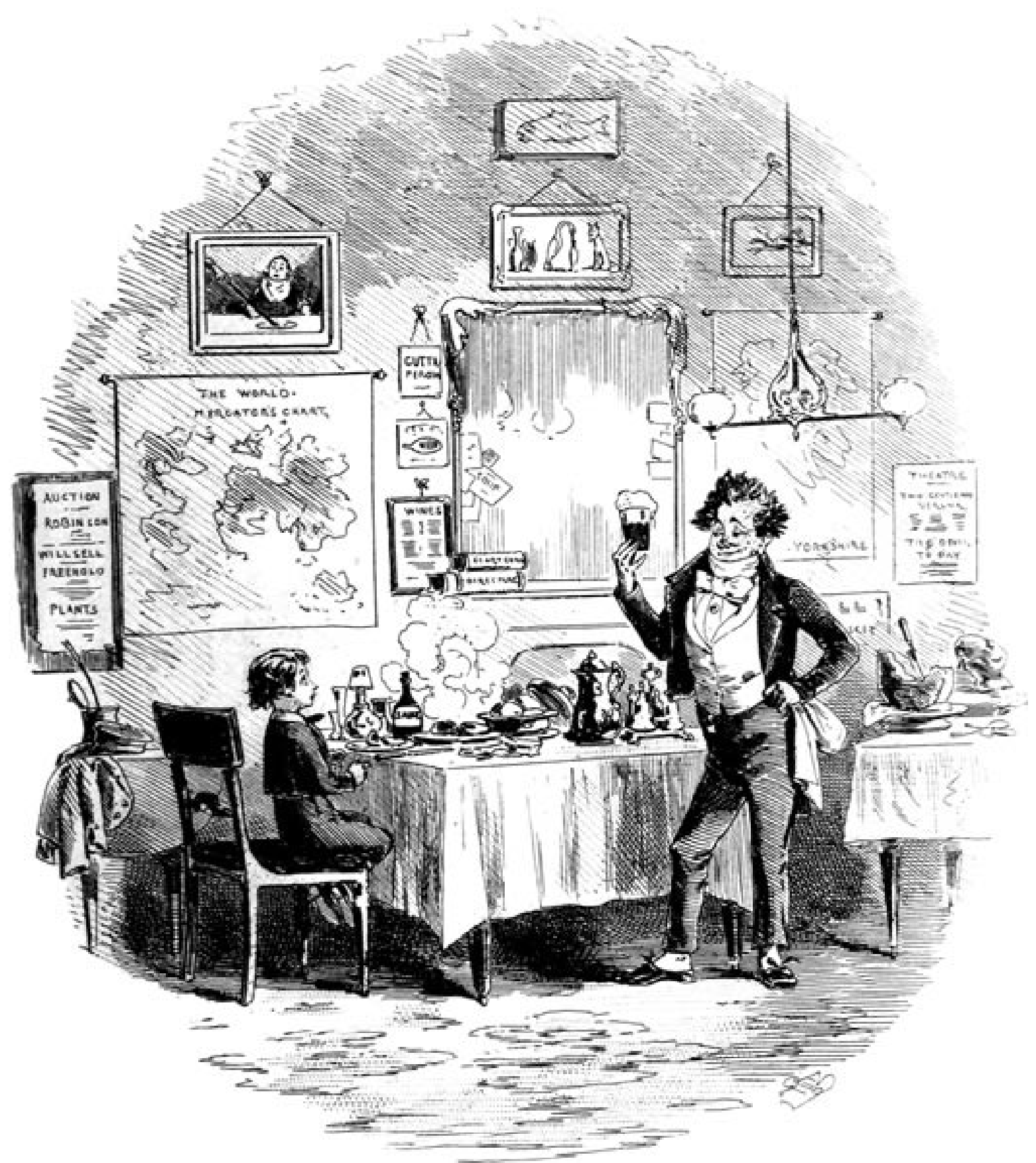
The friendly Waiter and I.

I replied that he would much oblige me by drinking it, if he thought he could do it safely, but by no means otherwise. When he did throw his head back, and take it off quick, I had a horrible fear, I confess, of seeing him meet the fate of the lamented Mr. Topsawyer, and fall lifeless on the carpet.