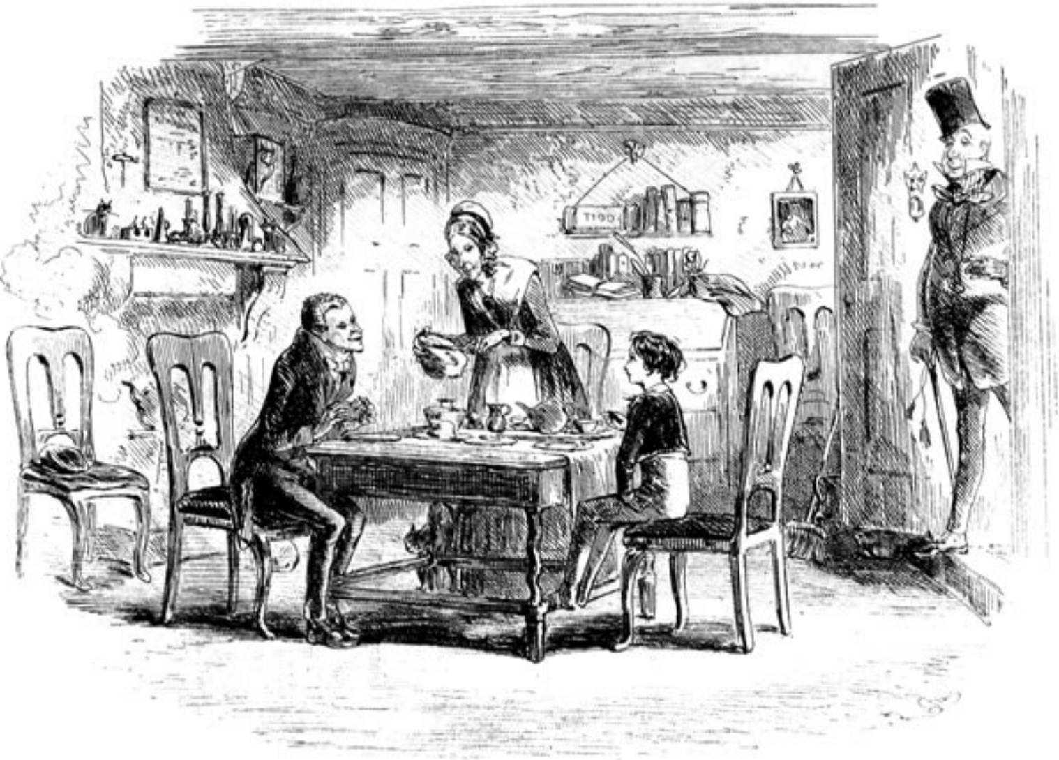
Somebody turns up.

It was Mr. Micawber! It was Mr. Micawber, with his eye-glass, and his walking-stick, and his shirt-collar, and his genteel air, and the condescending roll in his voice, all complete!