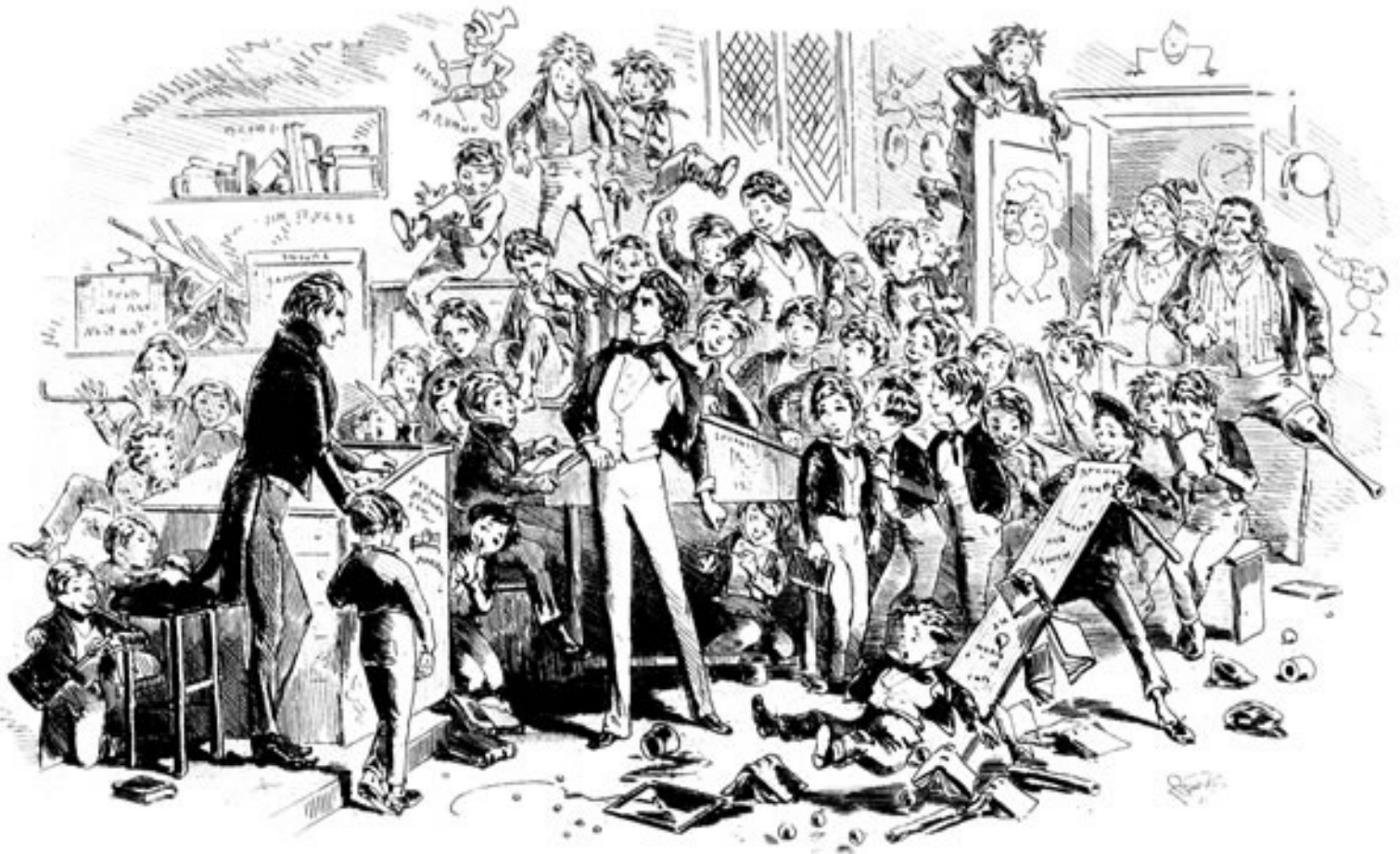
Steerforth and Mr. Mell.

To see Steerforth walk to church before us, arm-in-arm with Miss Creakle, was one of the great sights of my life. I didn't think Miss Creakle equal to little Em'ly in point of beauty, and I didn't love her (I didn't dare); but I thought her a young lady of extraordinary attractions, and in point of gentility not to be surpassed. When Steerforth, in white trousers, carried her parasol for her, I felt proud to know him; and believed that she could not choose but adore him with all her heart. Mr. Sharp and Mr. Mell were both notable personages in my eyes; but Steerforth was to them what the sun was to two stars.