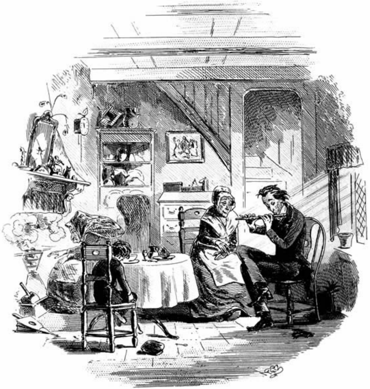
My musical breakfast.

When I seemed to have been dozing a long while, the Master at Salem House unscrewed his flute into the three pieces, put them up as before, and took me away. We found the coach very near at hand, and got upon the roof; but I was so dead sleepy, that when we stopped on the road to take up somebody else, they put me inside where there were no passengers, and where I slept profoundly, until I found the coach going at a footpace up a steep hill among green leaves. Presently, it stopped, and had come to its destination.