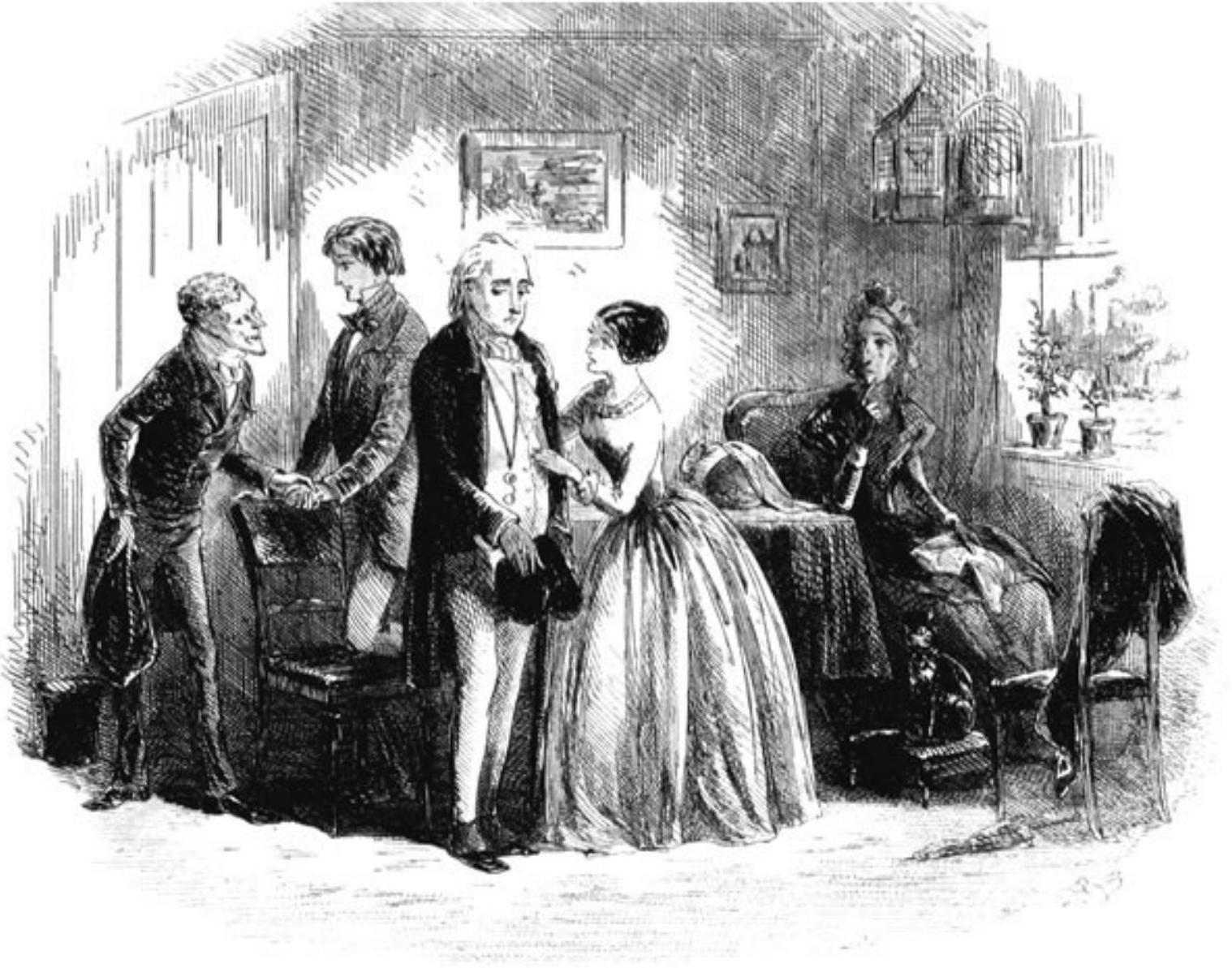
Mr. Wickfield and his partner wait upon my Aunt.

It was not that he looked many years older, though still dressed with the old scrupulous cleanliness; or that there was an unwholesome ruddiness upon his face; or that his eyes were full and bloodshot; or that there was a nervous trembling in his hand, the cause of which I knew, and had for some years seen at work. It was not that he had lost his good looks, or his old bearing of a gentleman—for that he had not—but the thing that struck me most, was, that with the evidences of his native superiority still upon him, he should submit himself to that crawling impersonation of meanness, Uriah Heep. The reversal of the two natures, in their relative positions, Uriah's of power and Mr. Wickfield's of dependence, was a sight more painful to me than I can express. If I had seen an Ape taking command of a Man, I should hardly have thought it a more degrading spectacle.