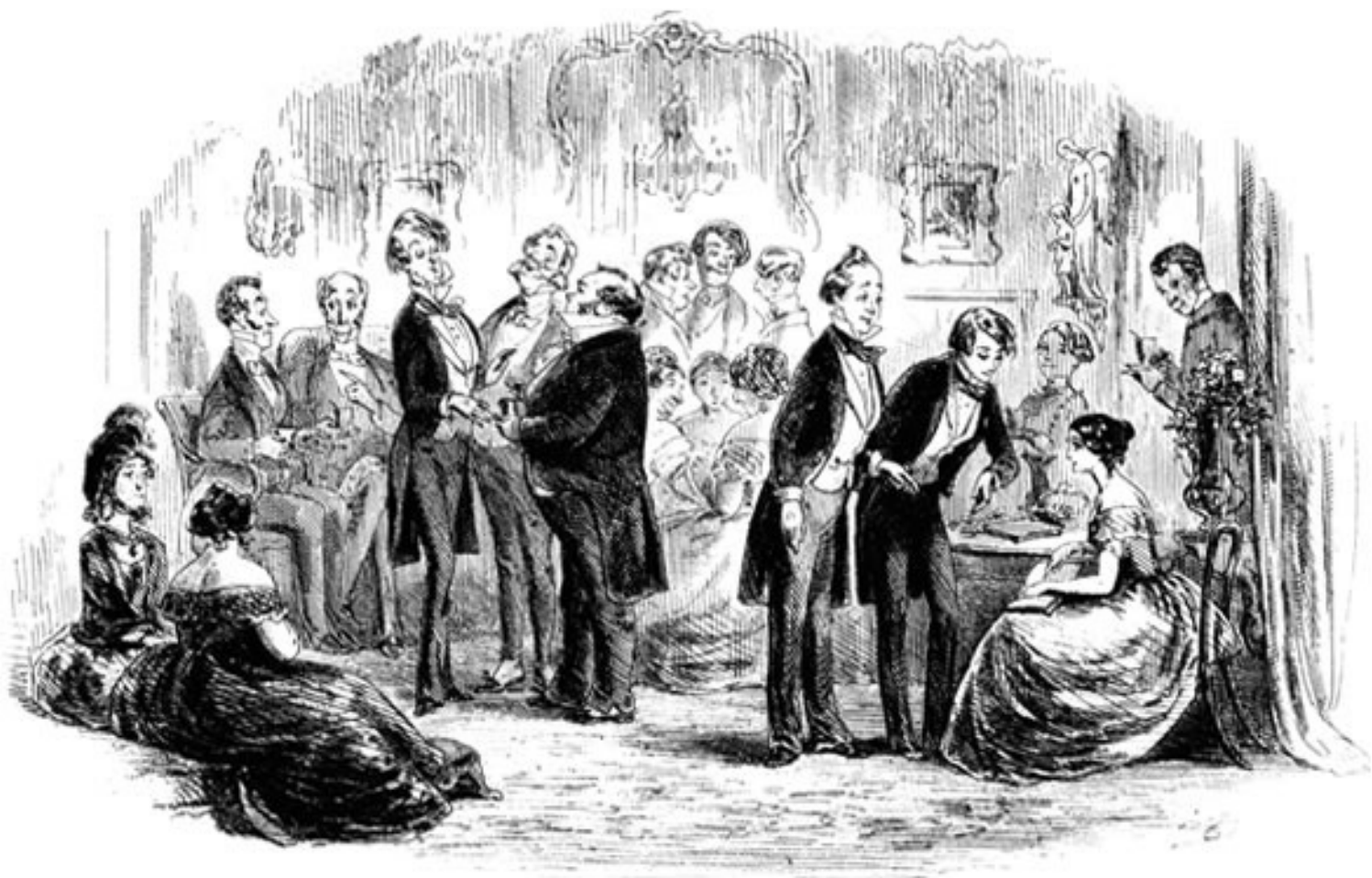
Uriah persists in hovering near us, at the dinner party.

I found Uriah Heep among the company, in a suit of black, and in deep humility. He told me, when I shook hands with him, that he was proud to be noticed by me, and that he really felt obliged to me for my condescension. I could have wished he had been less obliged to me, for he hovered about me in his gratitude all the rest of the evening; and whenever I said a word to Agnes, was sure, with his shadowless eyes and cadaverous face, to be looking gauntly down upon us from behind.