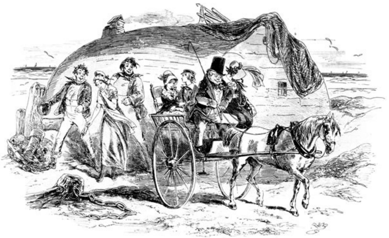
Mrs. Gummidge casts a damp on our departure

Away we went, however, on our holiday excursion; and the first thing we did was to stop at a church, where Mr. Barkis tied the horse to some rails, and went in with Peggotty, leaving little Em'ly and me alone in the chaise. I took that occasion to put my arm round Em'ly's waist, and propose that as I was going away so very soon now, we should determine to be very affectionate to one another, and very happy, all day. Little Em'ly consenting, and allowing me to kiss her, I became desperate; informing her, I recollect, that I never could love another, and that I was prepared to shed the blood of anybody who should aspire to her affections.