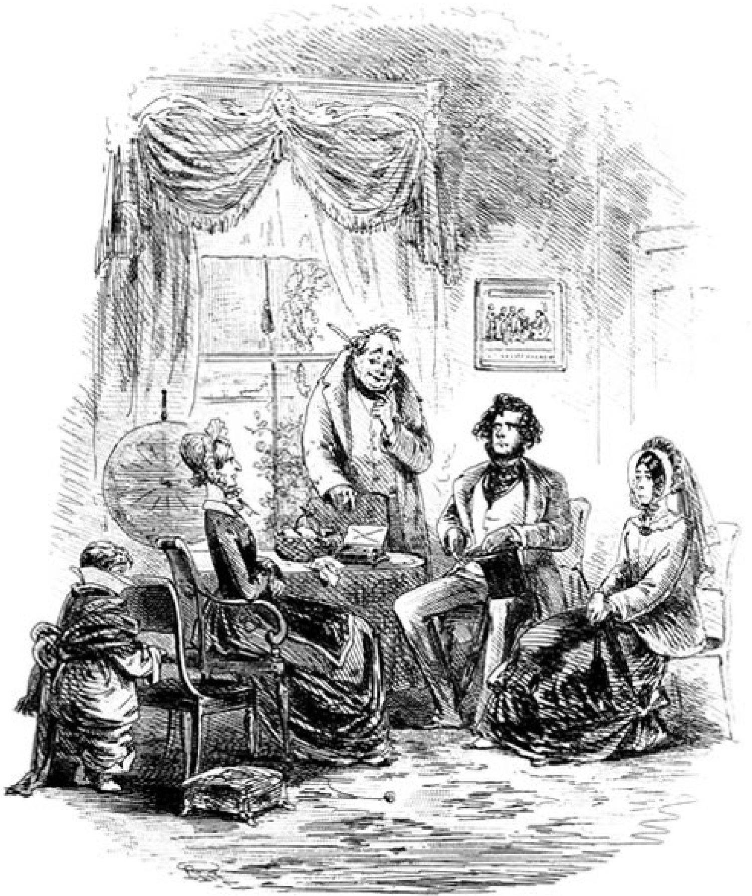
The momentous interview.

“Oh!” said my aunt, “I was not aware at first to whom I had the pleasure of objecting. But I don’t allow anybody to ride over that turf. I make no exceptions. I don’t allow anybody to do it.”