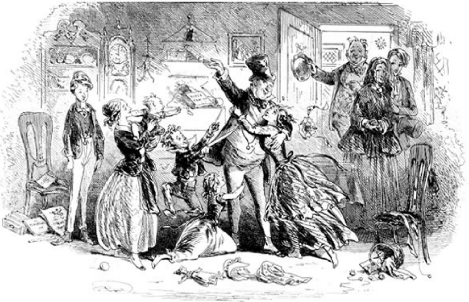
Restoration of mutual confidence between Mr. and Mrs. Micawber.

Mr. Micawber, supremely defiant of him and his extended finger, and making a great deal of his chest until he had slunk out at the door, then addressed himself to me, and proffered me the satisfaction of “witnessing the re-establishment of mutual confidence between himself and Mrs. Micawber.” After which, he invited the company generally to the contemplation of that affecting spectacle.