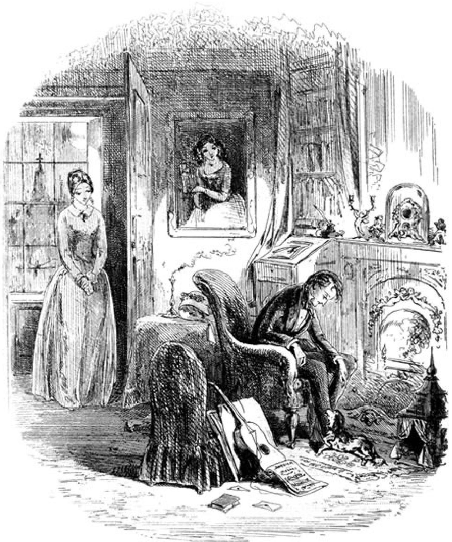
My child-wife's old companion.