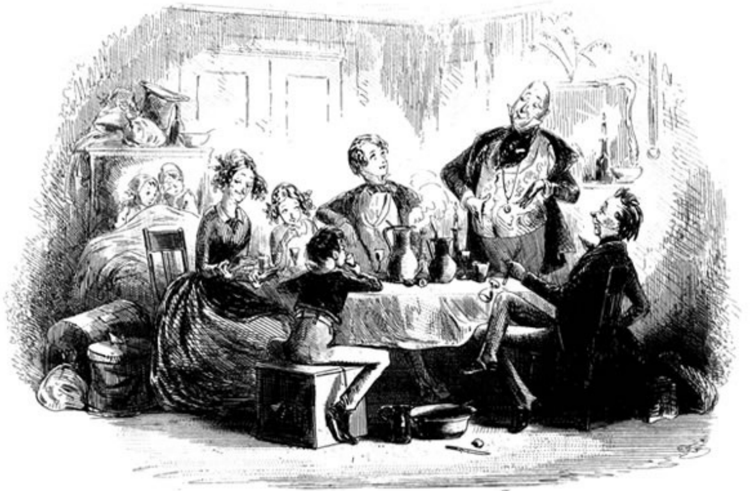
Mr. Micawber delivers some valedictory remarks.

Micawber will be safe to adorn. Under the temporary pressure of pecuniary liabilities, contracted with a view to their immediate liquidation, but remaining unliquidated through a combination of circumstances, I have been under the necessity of assuming a garb from which my natural instincts recoil—I allude to spectacles—and possessing myself of a cognomen, to which I can establish no legitimate pretensions. All I have to say on that score is, that the cloud has passed from the dreary scene, and the God of Day is once more high upon the mountain tops. On Monday next, on the arrival of the four o'clock afternoon coach at Canterbury, my foot will be on my native heath—my name, Micawber!”