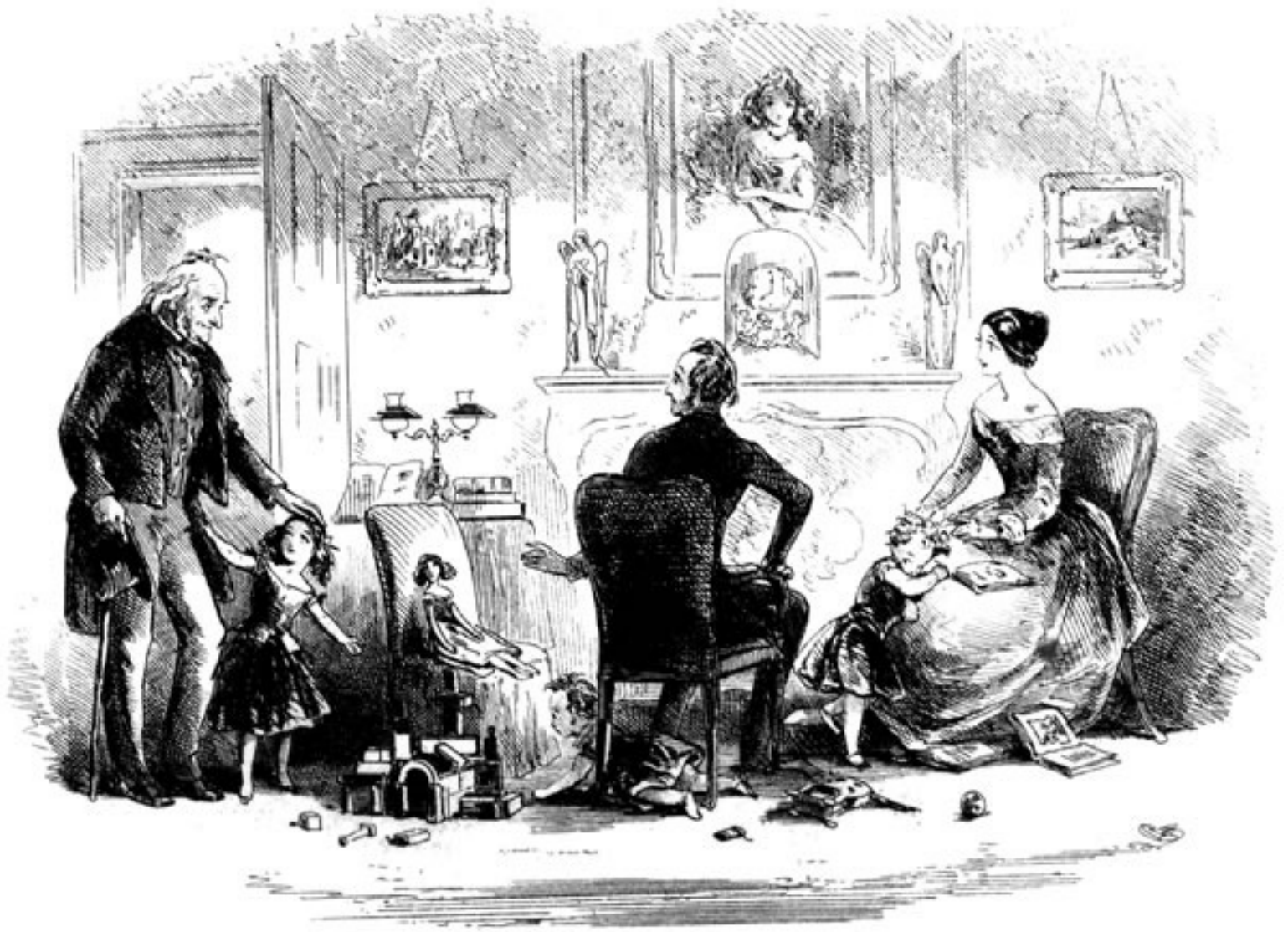
A Stranger calls to see me.

I had advanced in fame and fortune, my domestic joy was perfect, I had been married ten happy years. Agnes and I were sitting by the fire, in our house in London, one night in spring, and three of our children were playing in the room, when I was told that a stranger wished to see me.