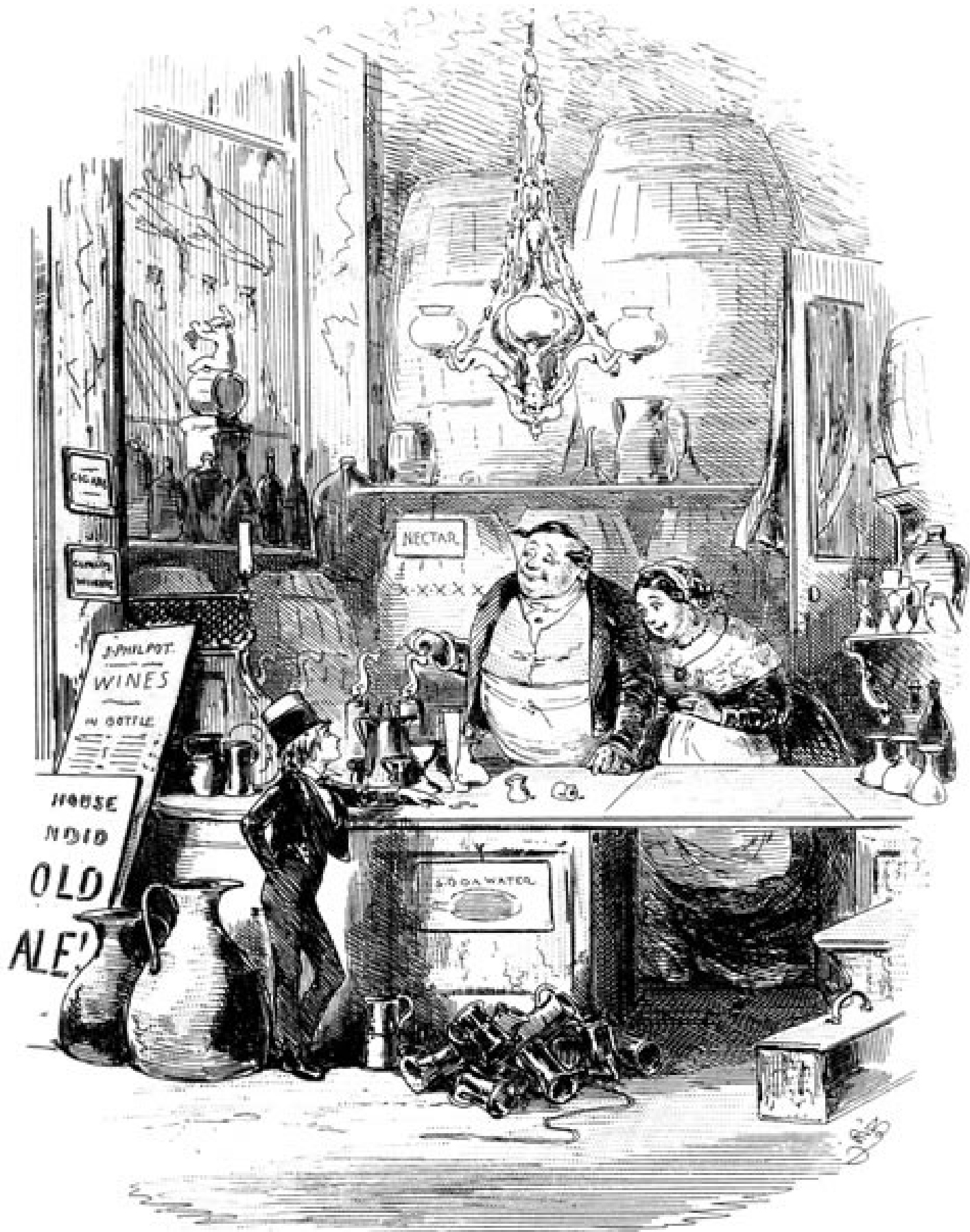
My magnificent order at the public-house

The landlord looked at me in return over the bar, from head to foot, with a strange smile on his face; and instead of drawing the beer, looked round the screen and said something to his wife. She