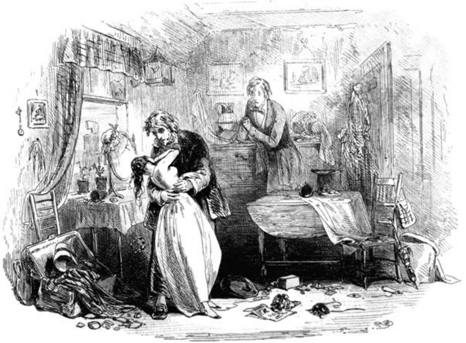
Mr. Peggotty's dream comes true.

“Mas’r Davy,” he said, in a low tremulous voice, when it was covered, “I thank my Heav’nly Father as my dream’s come true! I thank Him hearty for having guided of me, in His own ways, to my darling!”