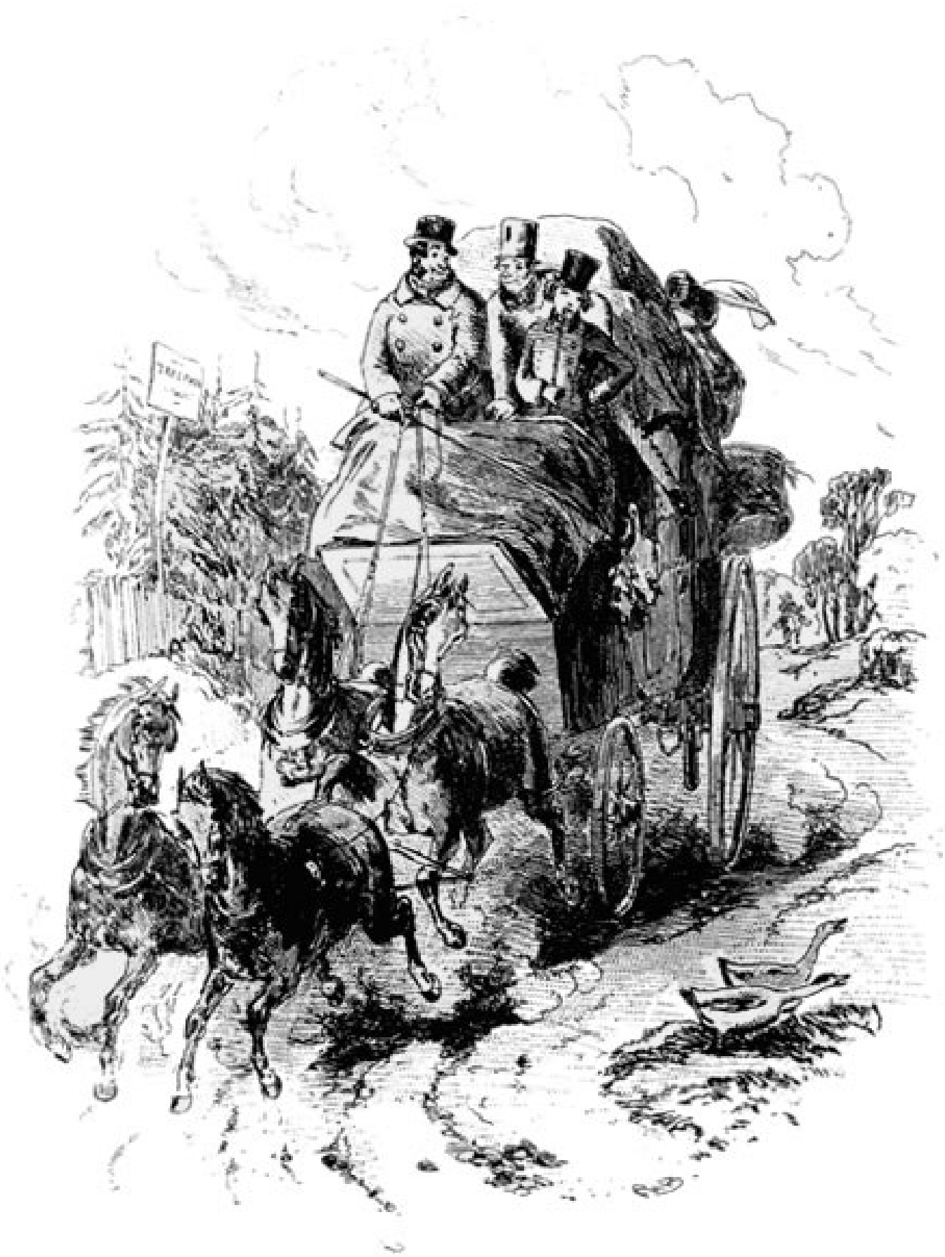
My first fall in life.

A distrust of myself, which has often beset me in life on small occasions, when it would have been better away, was assuredly not stopped in its growth by this little incident outside the Canterbury