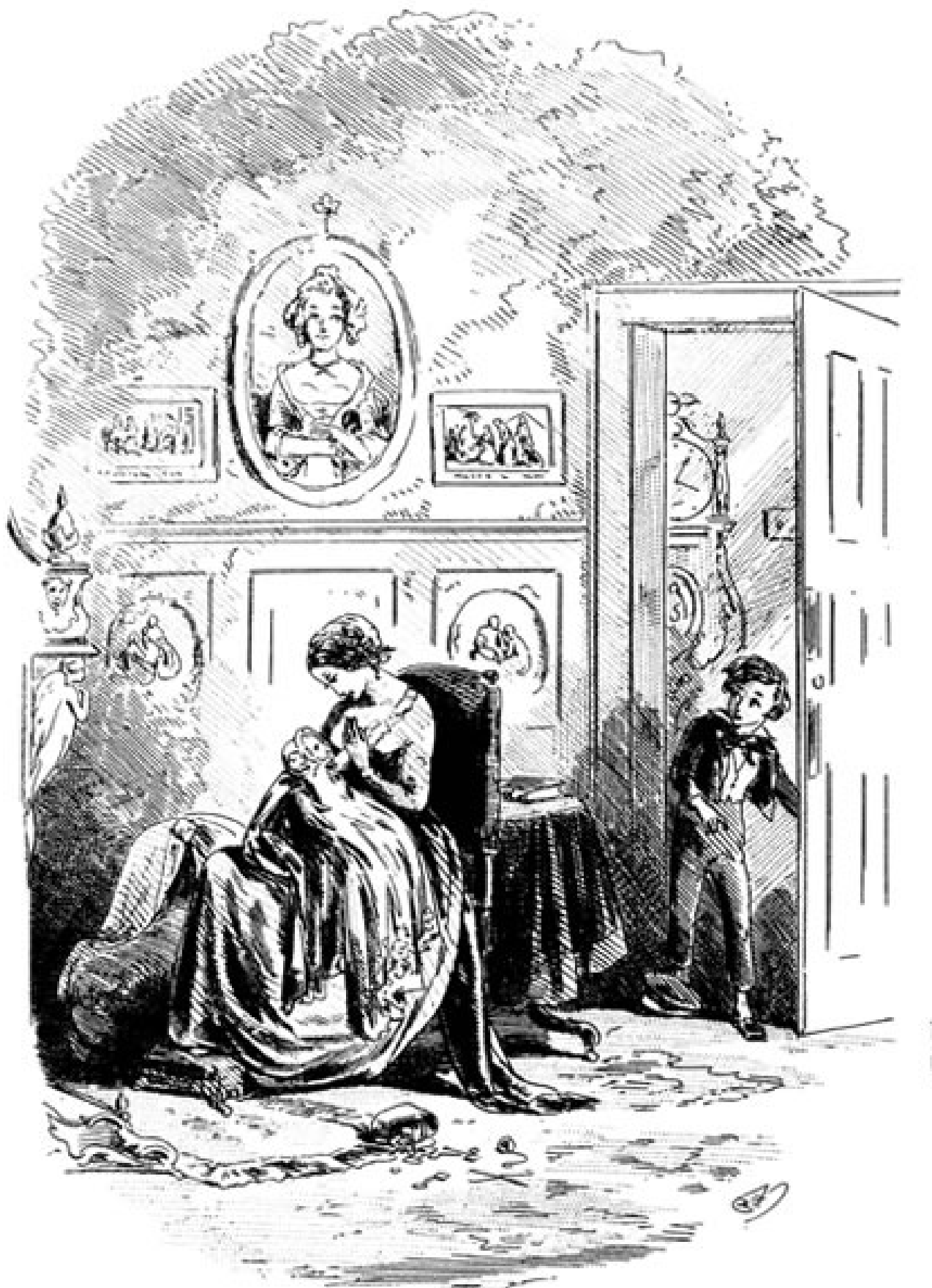
Changes at Home.

I spoke to her, and she started, and cried out. But seeing me, she called me her dear Davy, her own boy! and coming half across the room to meet me, kneeled down upon the ground and kissed me, and