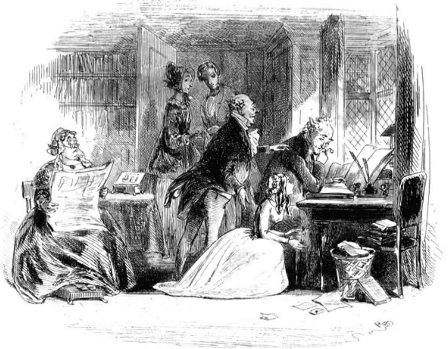
Mr. Dick fulfils my Aunt's prediction

The gentleness of the Doctor's manner and surprise, the dignity that mingled with the supplicating attitude of his wife, the amiable concern of Mr. Dick, and the earnestness with which my aunt said to herself, " That man mad! " (triumphantly expressive of the misery from which she had saved him), I see and hear, rather than remember, as I write about it.