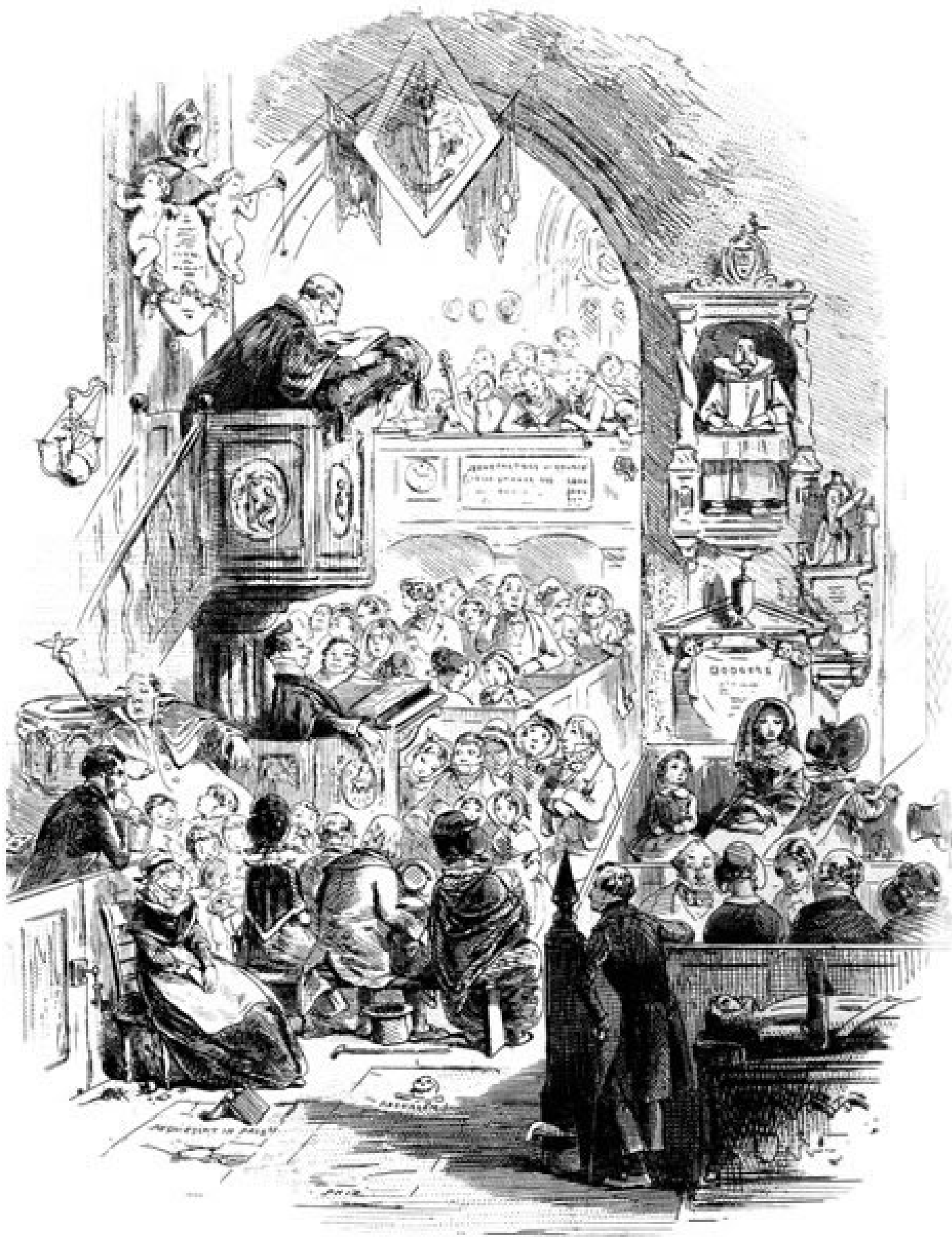
Our pew at church.

Here is our pew in the church. What a high-backed pew! With a window near it, out of which our house can be seen, and is seen many times during the morning's service, by Peggotty, who likes to