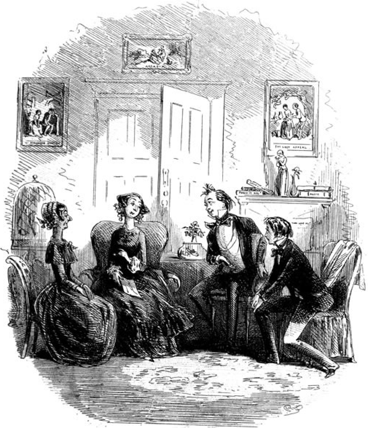
Traddles and I, in conference with the Misses Spenlow.

“Mr. Copperfield, I believe,” said the sister who had got my letter, addressing herself to Traddles. This was a frightful beginning. Traddles had to indicate that I was Mr. Copperfield, and I had to