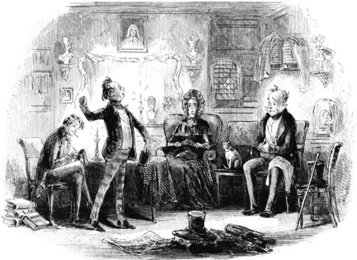
Traddles makes a figure in parliament, and I report him.

withering denunciations of the profligacy and corruption of my aunt and Mr. Dick; while I used to sit, at a little distance, with my note-book on my knee, fagging after him with all my might and main. The inconsistency and recklessness of Traddles were not to be exceeded by any real politician. He was for any description of policy, in the compass of a week; and nailed all sorts of colours to every denomination of mast. My aunt, looking very like an immoveable Chancellor of the Exchequer, would occasionally throw in an interruption or two, as "Hear!" or "No!" or "Oh!" when the text seemed to require it: which was always a signal to Mr. Dick (a perfect country gentleman) to follow lustily with the same cry. But Mr. Dick got taxed with such things in the course of his Parliamentary career, and was made responsible for such awful consequences, that he became uncomfortable in his mind sometimes. I believe he actually began to be afraid he really had been doing something, tending to the annihilation of the British constitution, and the ruin of the country.