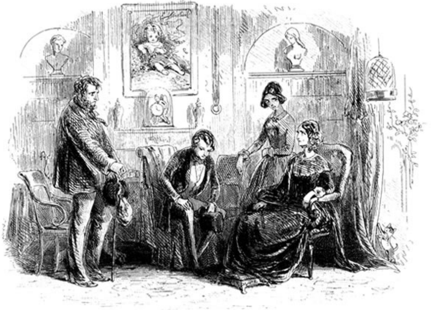
Mr. Peggotty and Mrs. Steerforth.

I saw, directly, in his mother's face, that she knew from himself what he had done. It was very pale; and bore the traces of deeper emotion than my letter alone, weakened by the doubts her fondness would have raised upon it, would have been likely to create. I thought her more like him than ever I had thought her; and I felt, rather than saw, that the resemblance was not lost on my companion.